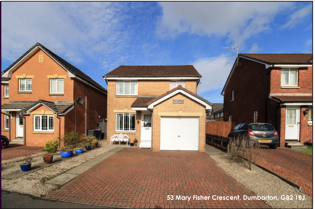
53 Mary Fisher Crescent, Dumbarton, G82 1BJ

This impressive three-bedroom detached villa with single garage is located in this extremely popular residential development and is close to a wide range of amenities, schooling and public transport links. Presented in excellent condition this home is sure to generate great interest and viewing is highly recommended.