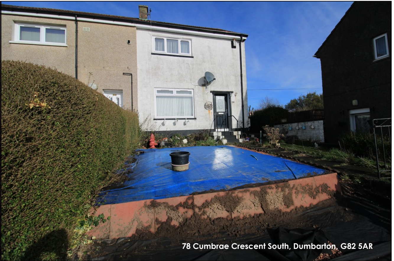
78 Cumbrae Crescent South, Dumbarton, G82 5AR

This two bedroom end terrace villa sits in an elevated position in the popular Castlehill Estate and enjoys open outlooks out towards River Clyde. The property will require upgrading throughout, which is reflected in the price, but will make a fantastic home on completion of the works.