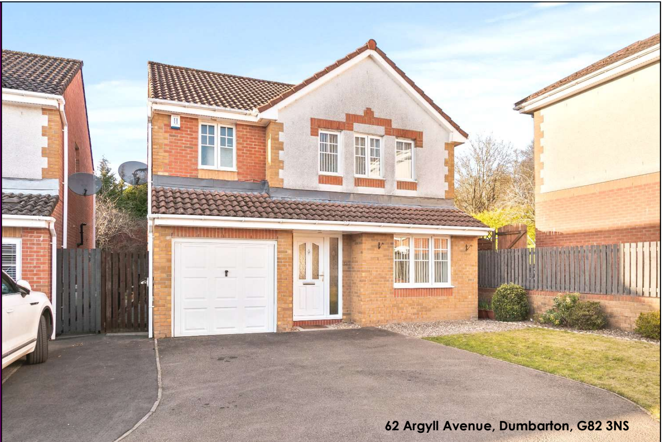
62 Argyll Avenue, Dumbarton, G82 3NS

Beautifully presented four bedroom detached villa, with single integrated garage, located within much sought after select residential development and quiet cul de sac. The property which was built by Taylor Wimpey is in immaculate condition and offers versatile layout over two levels with 4 bedrooms and 2 public rooms one of which could easily be utilised as a fifth bedroom. Modern light décor, quality flooring throughout, modern kitchen, two ensuite shower rooms, family shower room, downstairs wc and a large south facing garden.