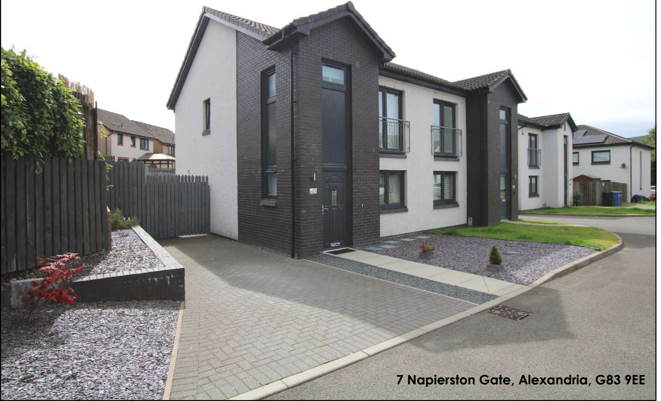
7 Napierston Gate, Alexandria, G83 9EE

This 3 bedroom semi detached villa is situated at the head of a quiet cul de sac and within an exclusive residential modern development.