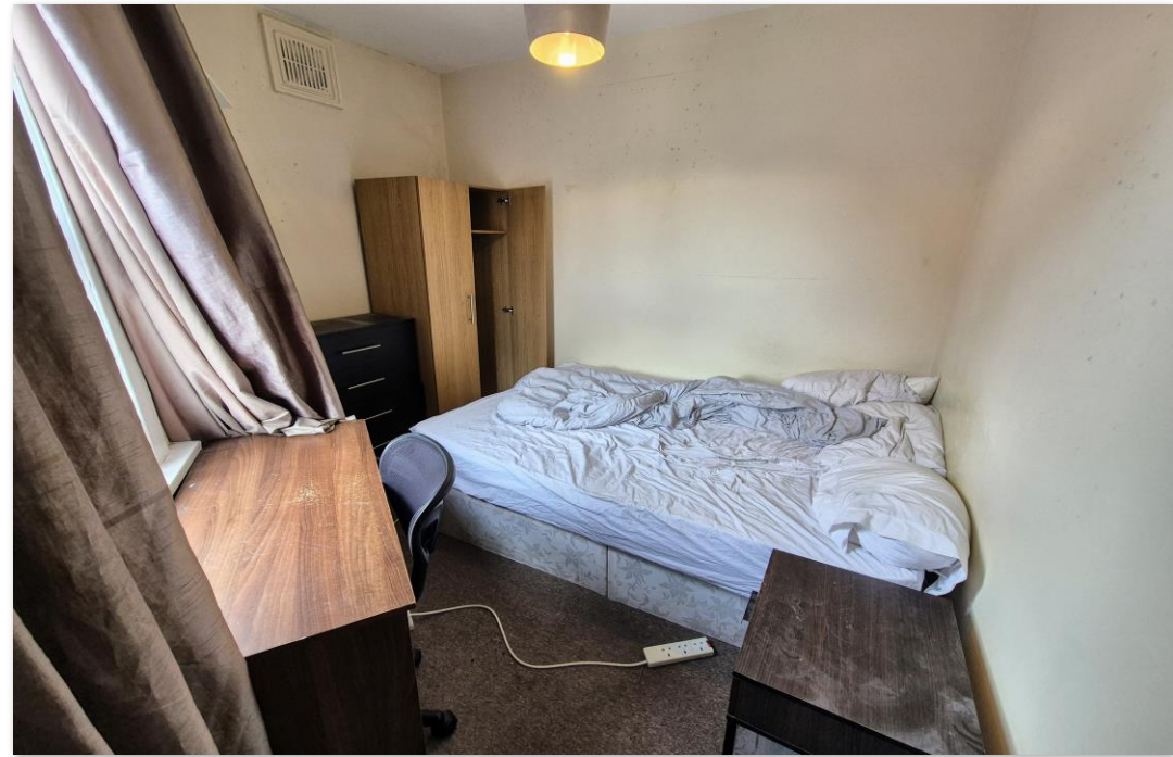
10 Welton Road