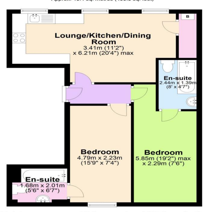
Total area: approx. 46.4 sq. metres (499.3 sq. feet)

Floor plans are for identification only. All measurements are approximate. Plan produced using PlanUp.