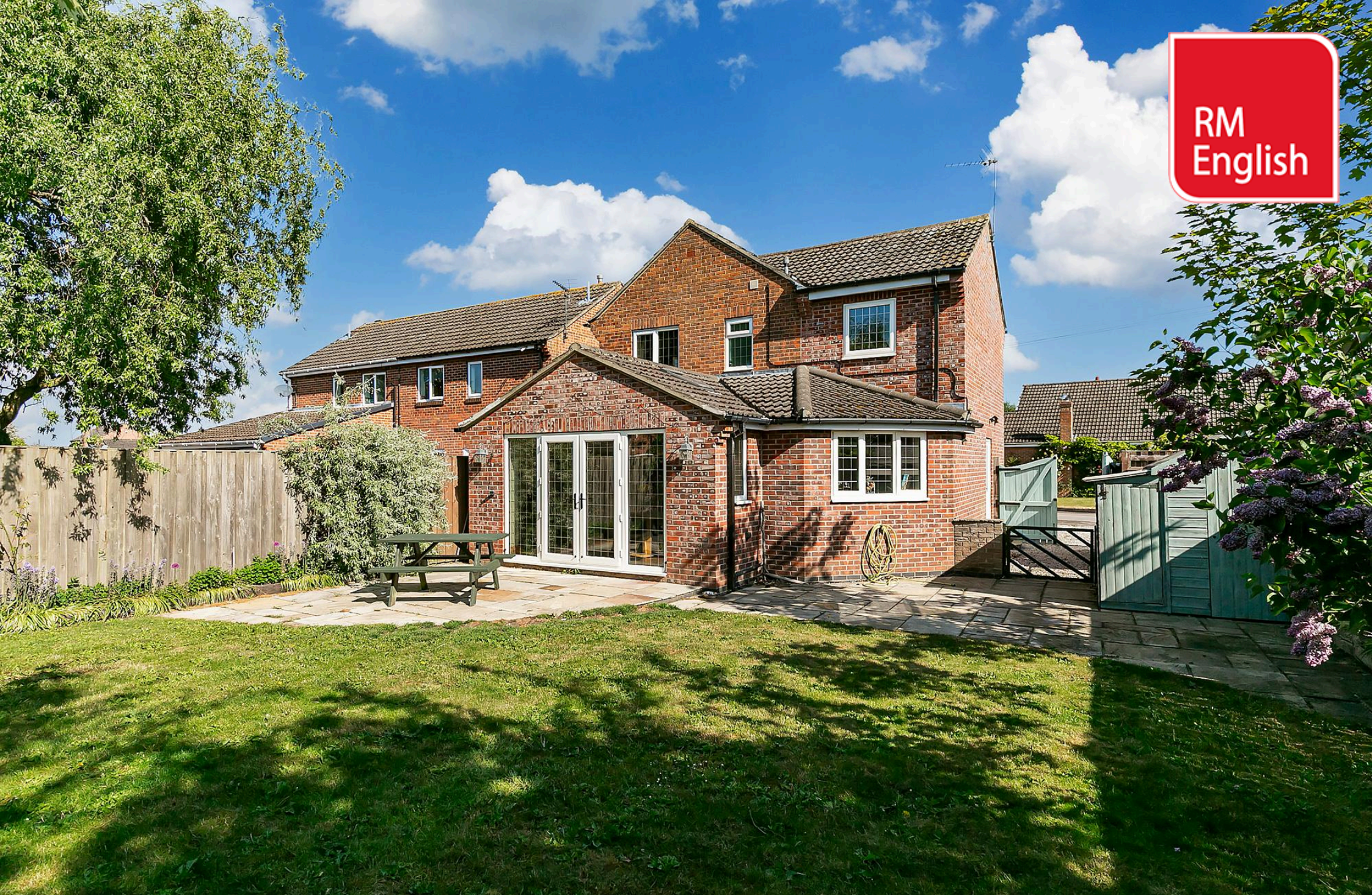
Old Lea, Holme On Spalding Moor, York, YO43 4BL