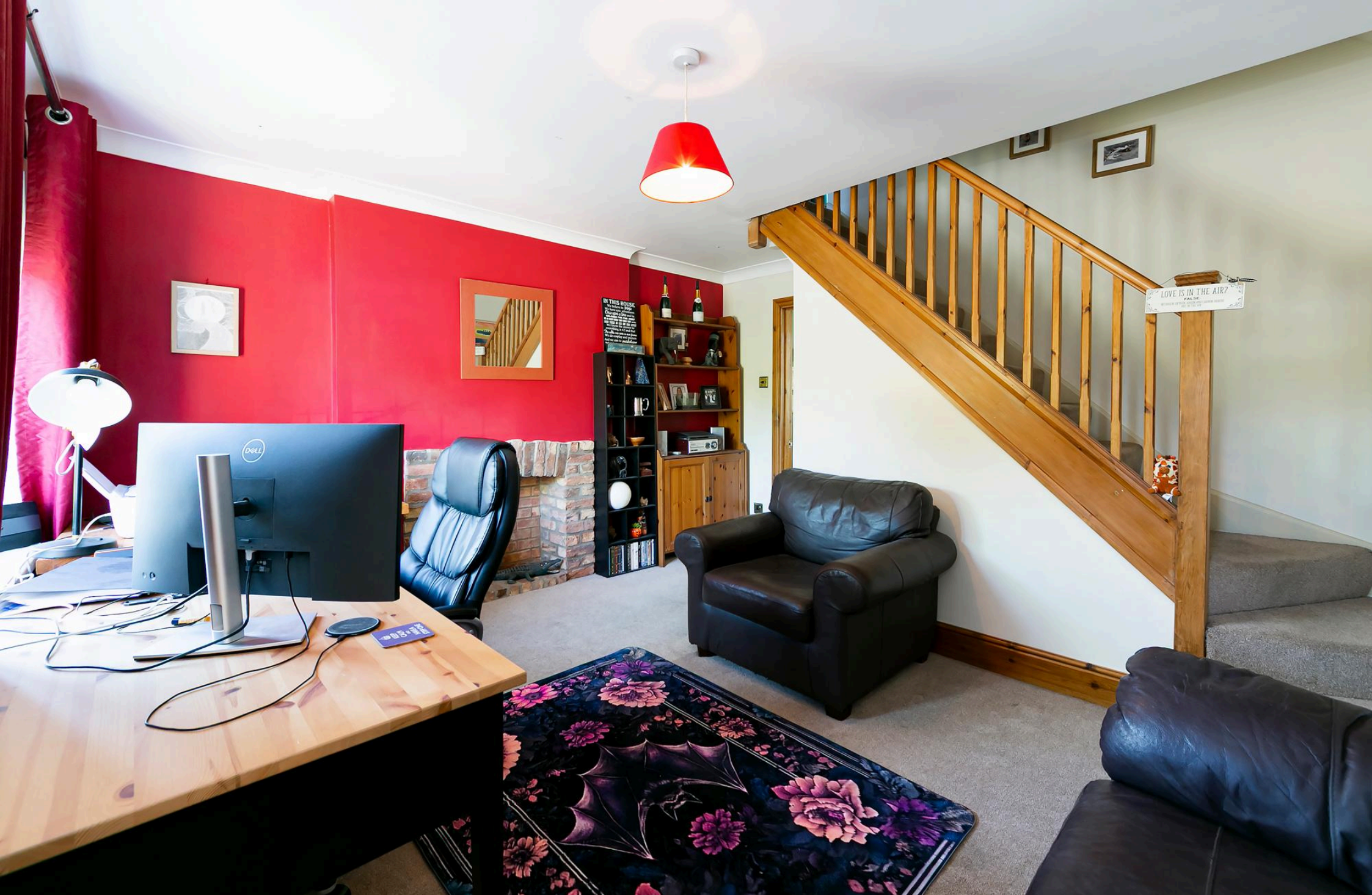
AN ATTRACTIVE FAMILY HOME WITH A STUNNING OPEN PLAN KITCHEN/LIVING/DINING AREA