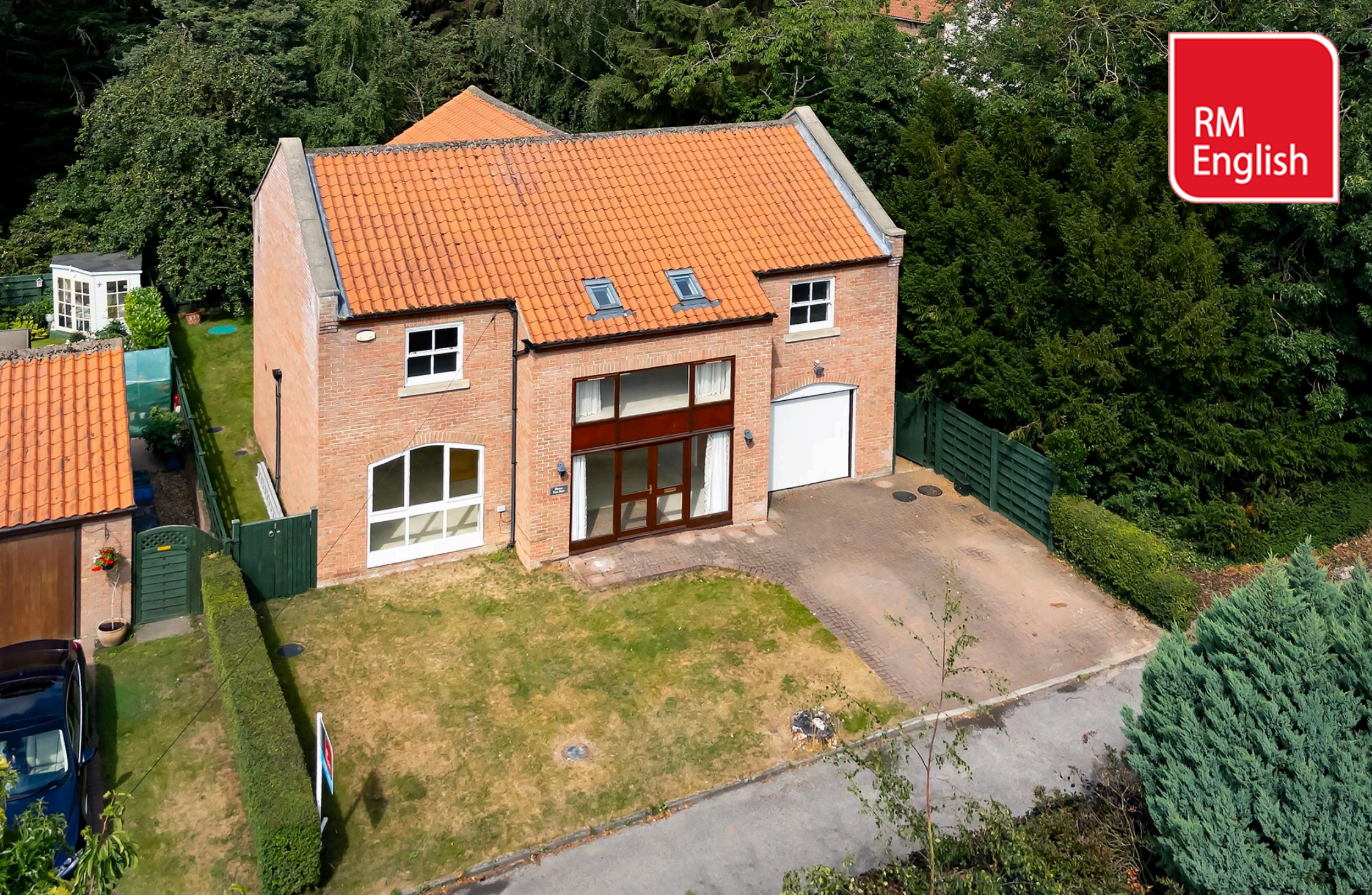
Main Street, Kelfield, York, North Yorkshire, YO19 6RG