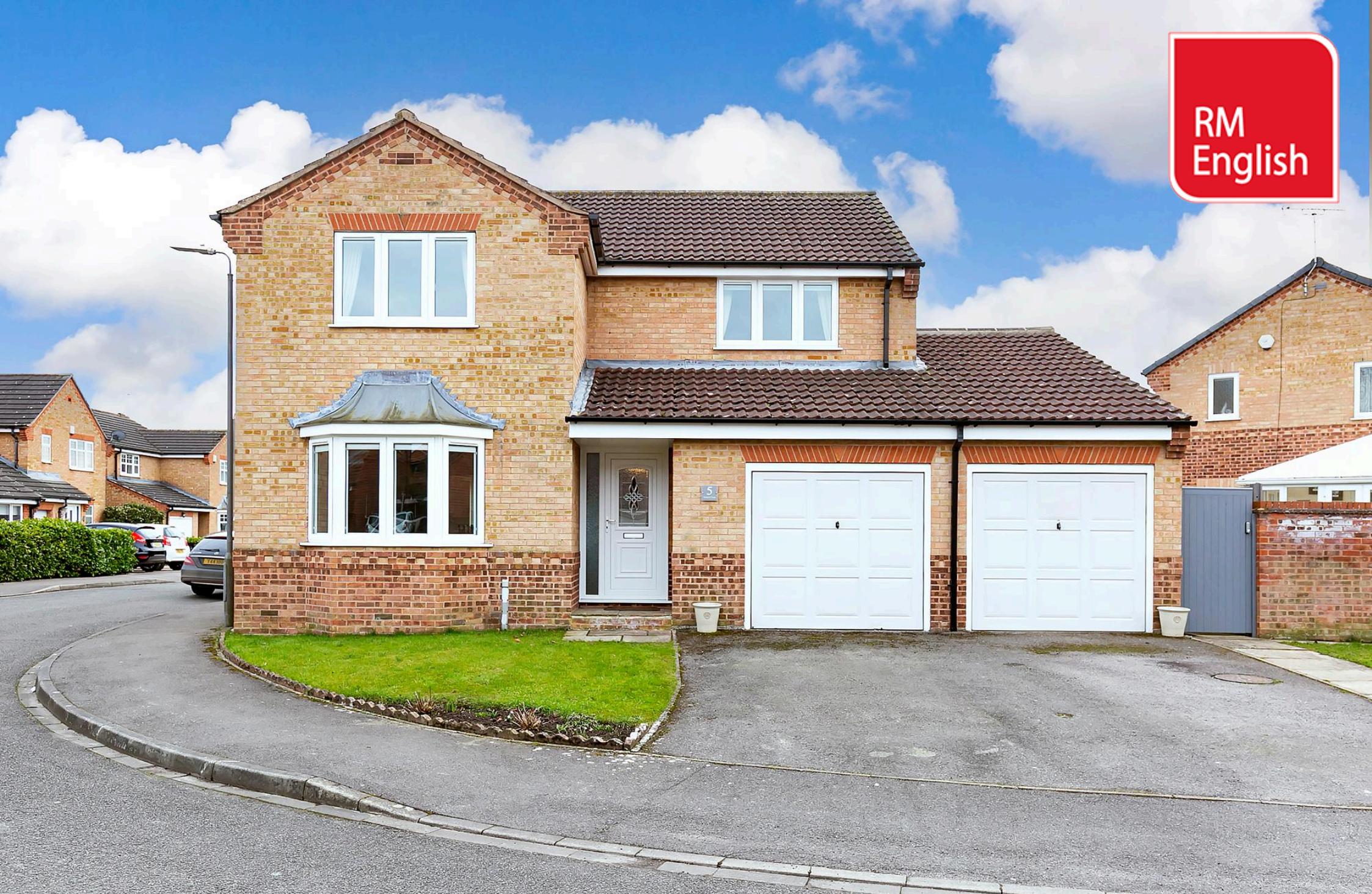
5 School Close, Stamford Bridge, York, YO41 1PT