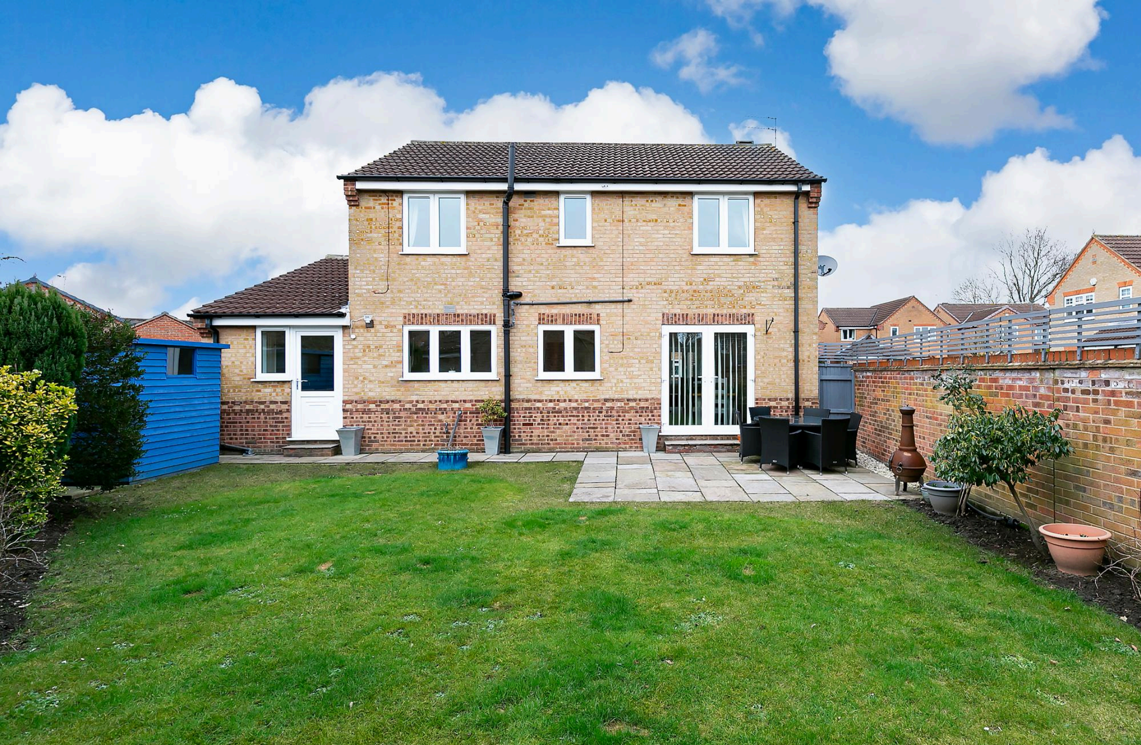
FOUR BEDROOM DETACHED FAMILY HOME