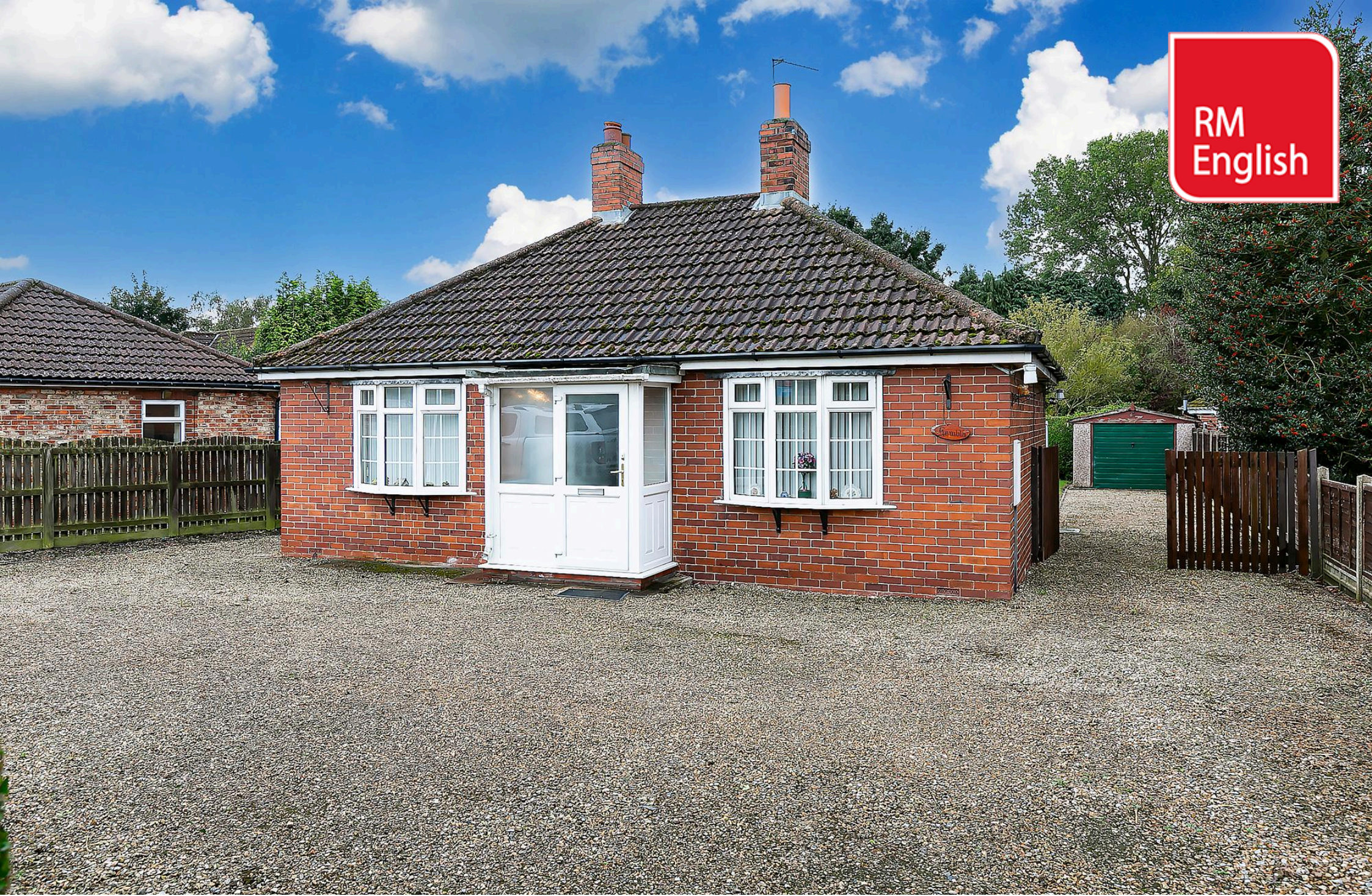
Kembla, York Road, Barmby Moor, York, North Yorkshire, YO42 4HT