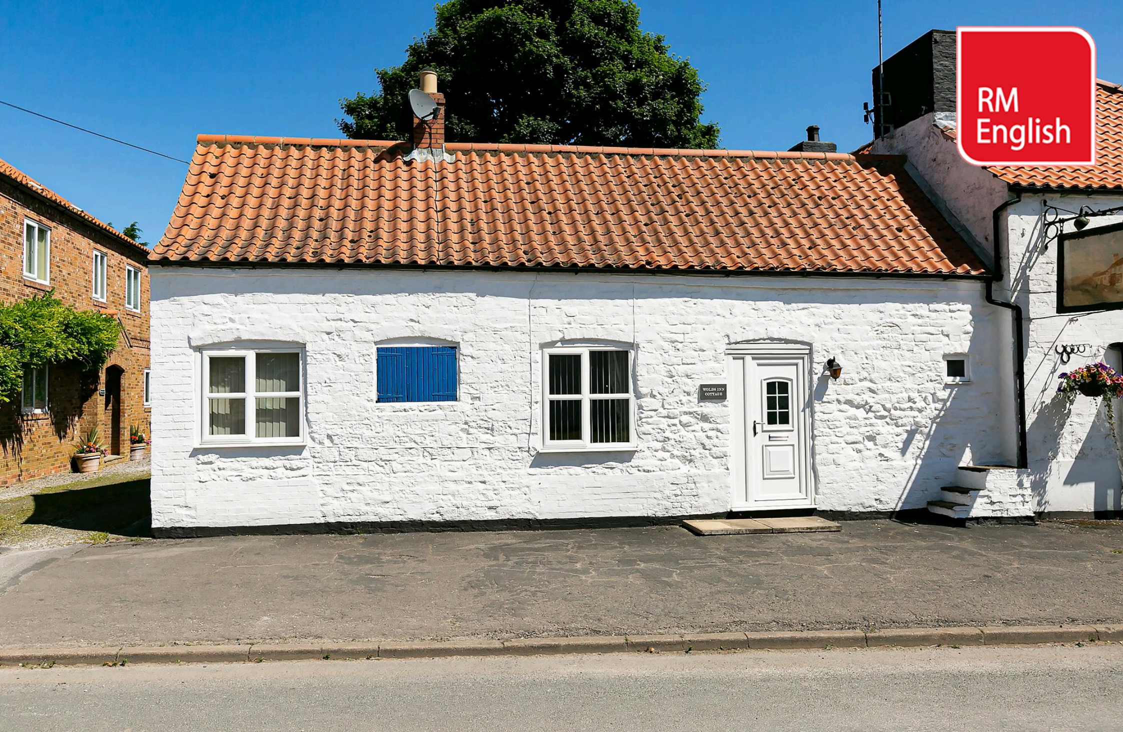
Wolds Inn Cottage, Driffield Road, Huggate, York, YO42 1YH