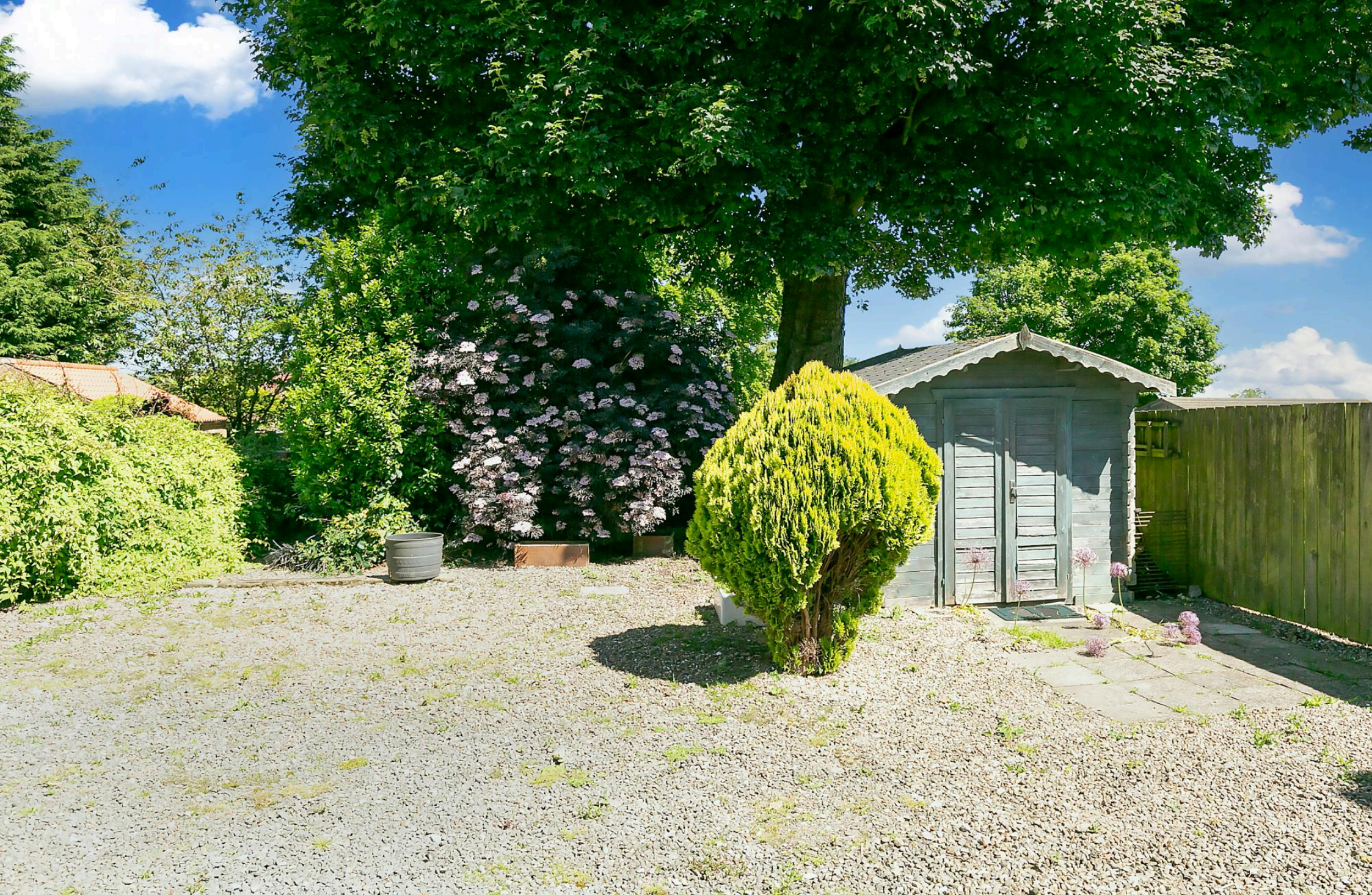
A LOVELY COTTAGE IN THE HEART OF HUGGATE