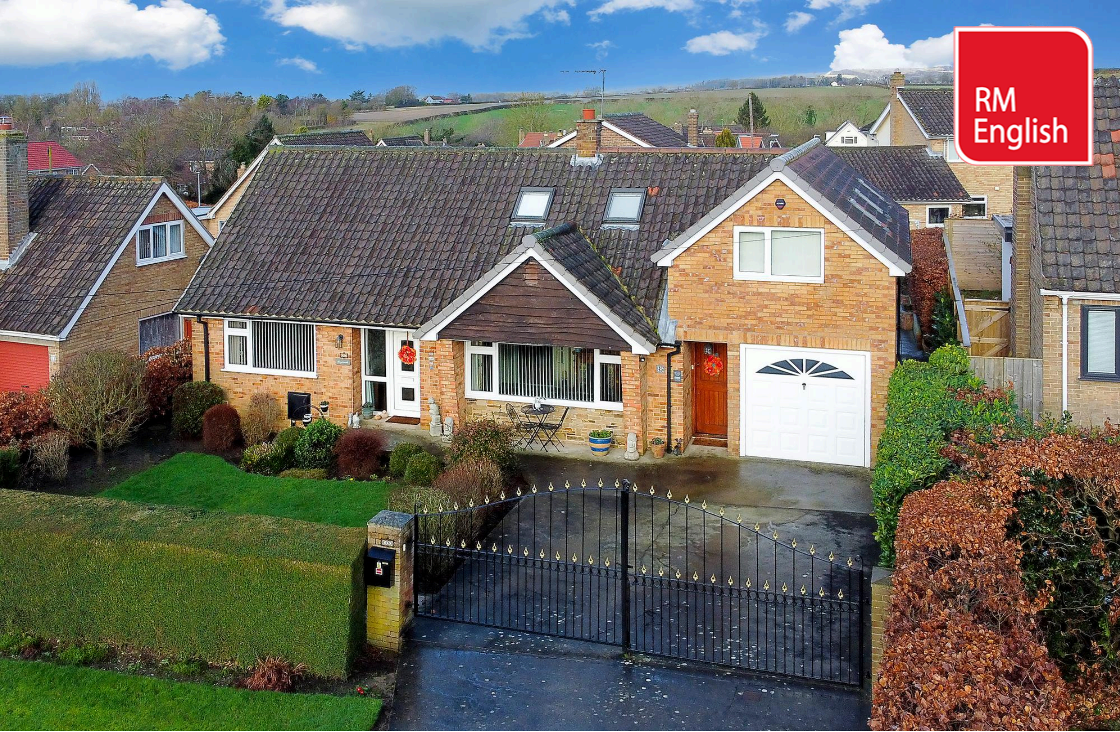
Spring Road, Market Weighton, York, YO43 3JG