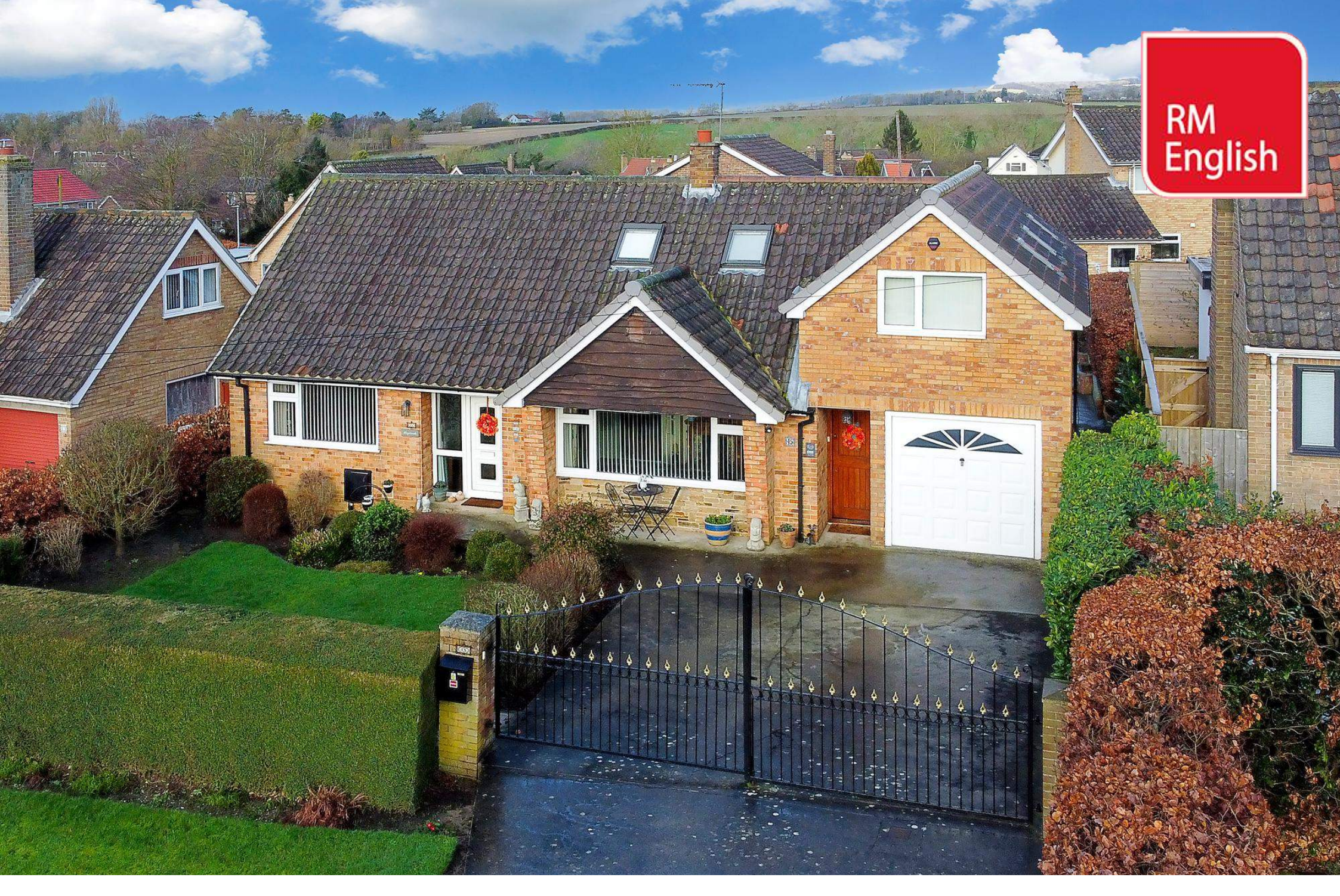
Spring Road, Market Weighton, York, YO43 3JG