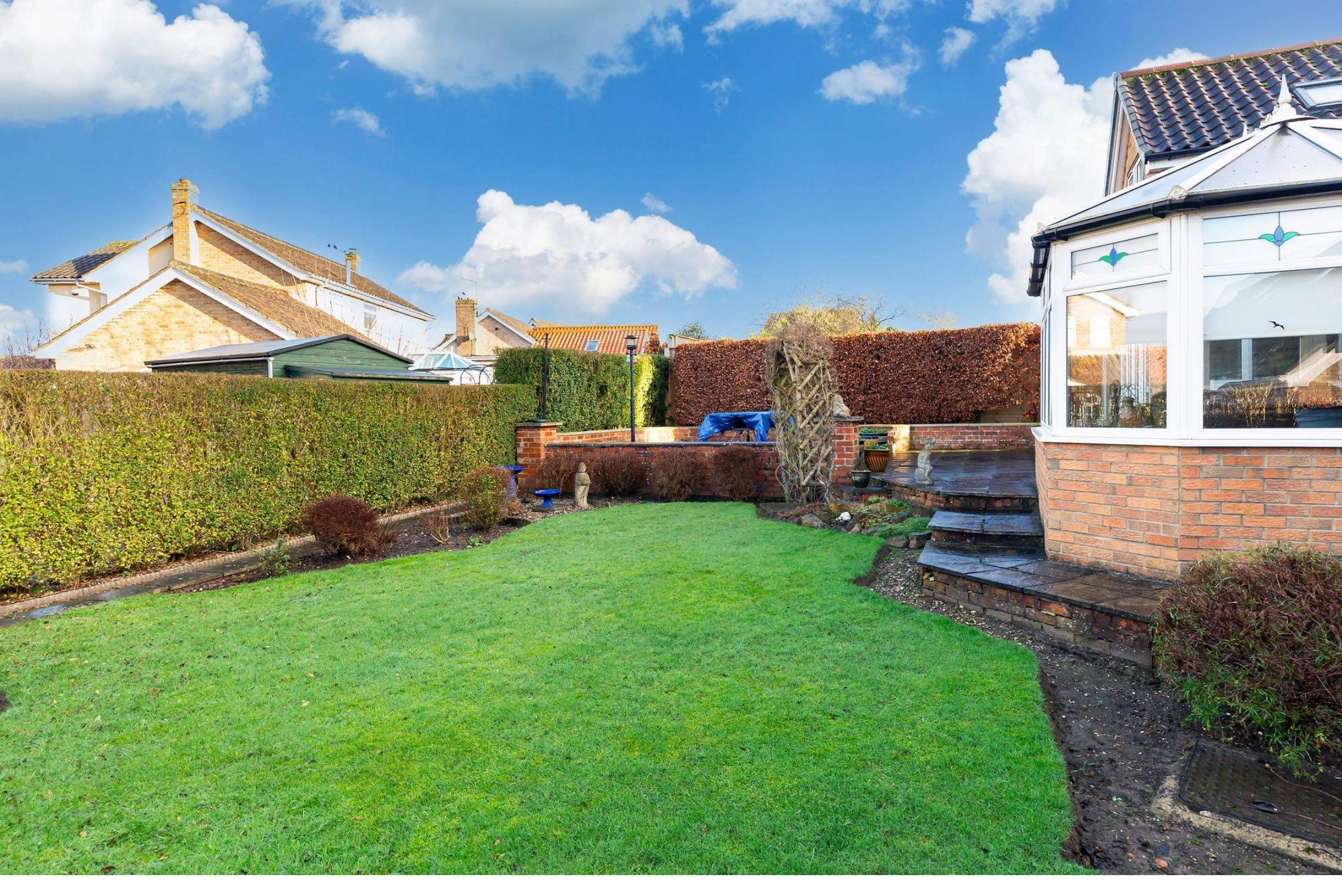
AN IMMACULATE FAMILY HOME WITH NO ONWARD CHAIN