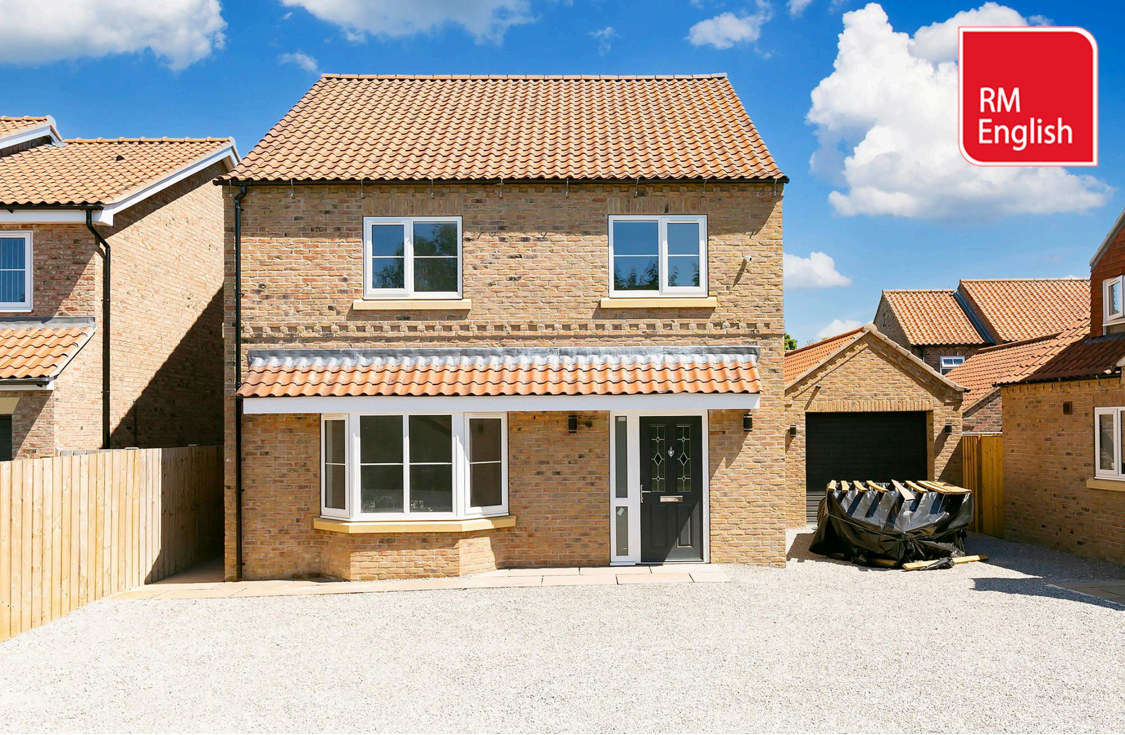
York Road, Hayton, York, YO42 1RJ