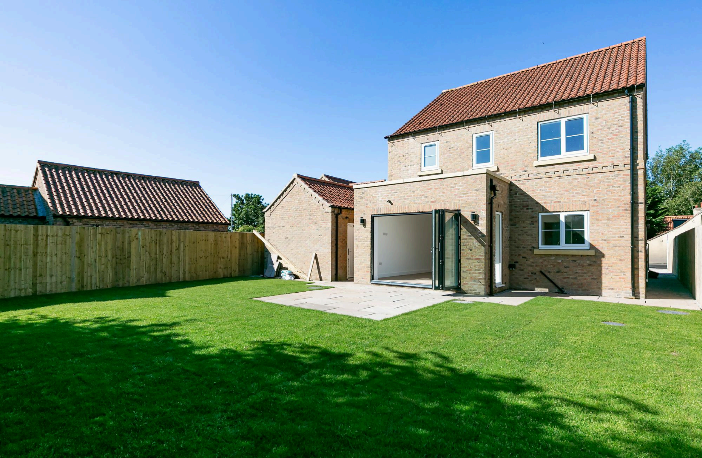
A STUNNING NEW BUILD WITH A LARGE GARDEN AND GARAGE