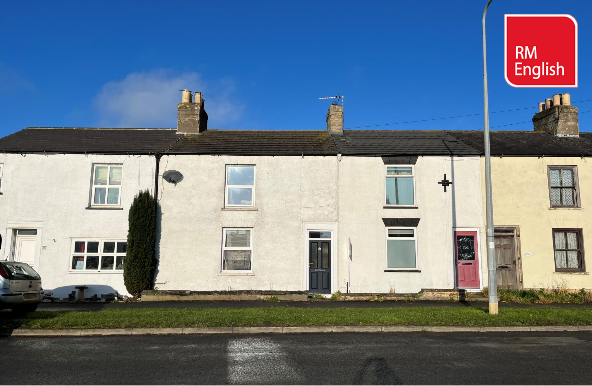
96 Holme Road, Market Weighton, York, North Yorkshire, YO43 3ES