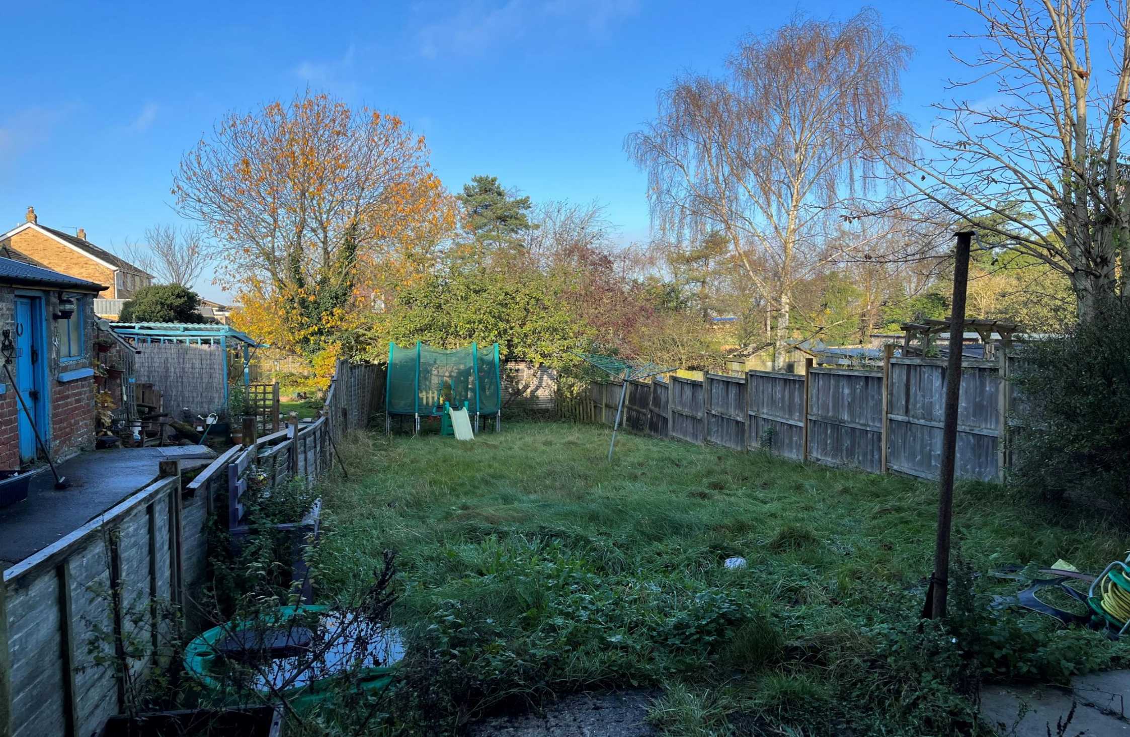
A smart 2 bedroom terraced house with a large rear garden