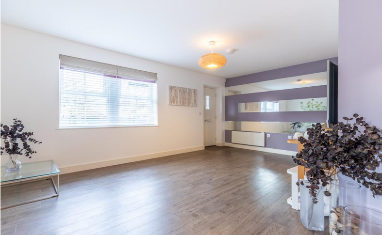
Open Plan Living/Kitchen/Dining Room