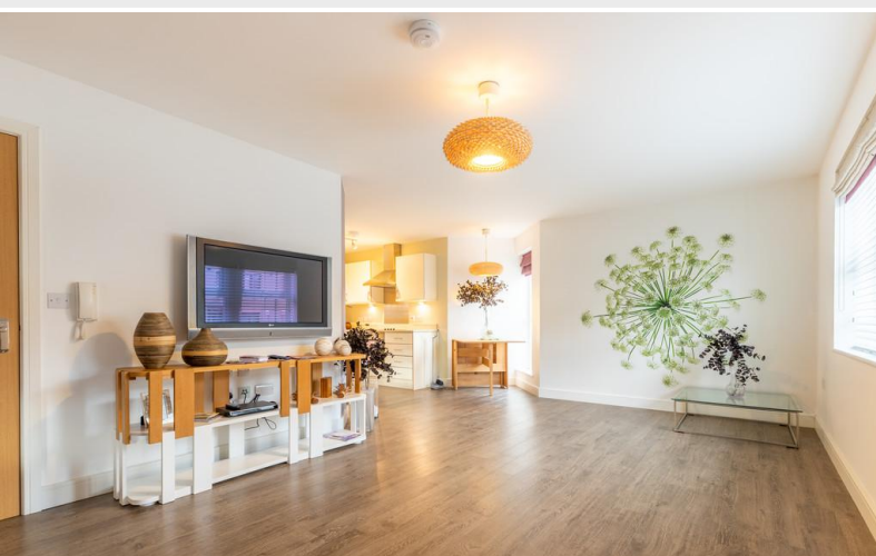
Open Plan Living/Kitchen/Dining Room