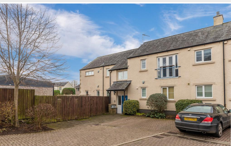
Parking Area and Communal Entrance

This apartment benefits from having a private entrance to the front of the property as well as a communal entrance from the parking. From the private entrance, step inside to discover a well-planned living space that seamlessly combines comfort and style. The spacious living area is a highlight, featuring a lounge and kitchen space that benefits from a feature picture window, flooding the room with natural light and offering a delightful dual aspect. The kitchen is a testament to modern design, boasting wood effect wall and base units with sleek chrome handles. The light grey marble effect worktop adds a touch of elegance, while integrated Zanussi appliances, including an electric oven, hob, extractor fan, washer/dryer and fridge, ensure convenience and efficiency. A stainless steel sink and drainer with a mixer tap complete this stylish culinary space.