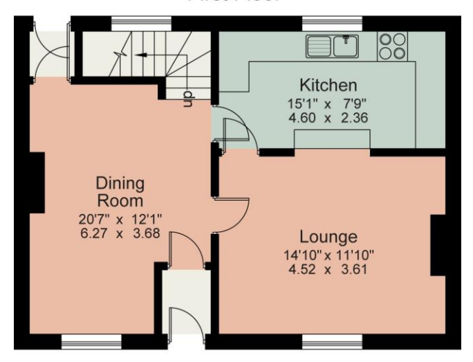
Ground Floor Approx Gross Floor Area = 1649.7 Sq. Feet = 153.2 Sq. Metres For illustrative purposes only. Not to scale.

All permits to view and particulars are issued on the understanding that negotiations are conducted through the agency of Messrs. Hackney & Leigh Ltd. Properties for sale by private treaty are offered subject to contract. No responsibility can be accepted for any loss or expense incurred in viewing or in the event of a property being sold, let, or withdrawn. Please contact us to confirm availability prior to travel. These particulars have been prepared for the guidance of intending buyers. No guarantee of their accuracy is given, nor do they form part of a contract. Broadband speeds estimated and checked by <a href="https://checker.ofcom.org.uk/en-gb/broadband-coverage">https://checker.ofcom.org.uk/en-gb/broadband-coverage</a> on 11/07/2023.