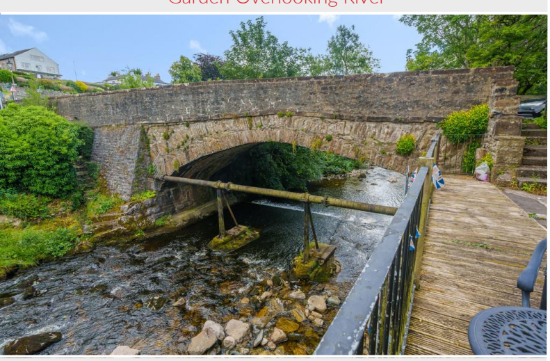
Garden Overlooking River