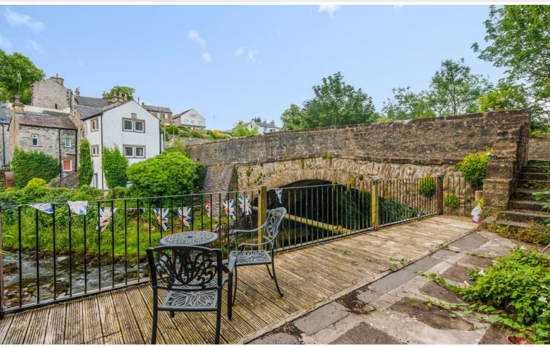
Garden Overlooking River