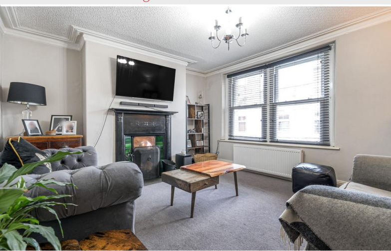
Living Room/Bedroom Two