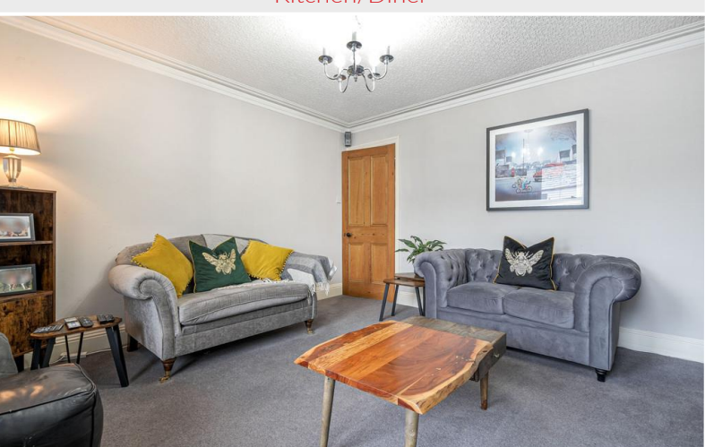
Living Room/Bedroom Two