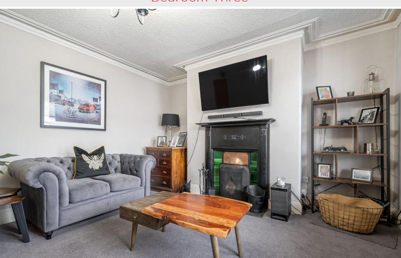
Living Room/Bedroom Two