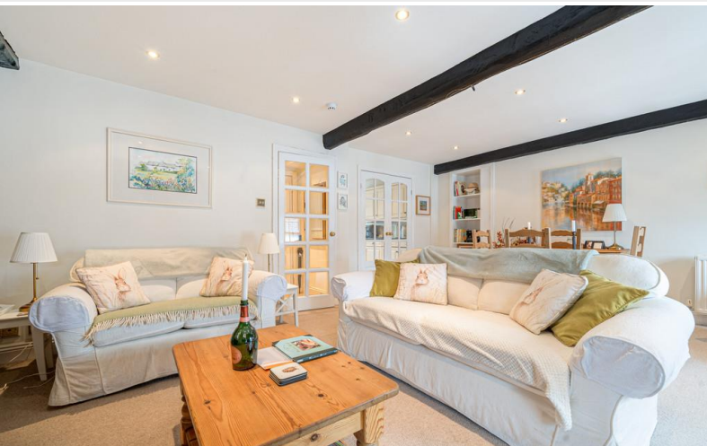
Open Plan Living/Dining Room