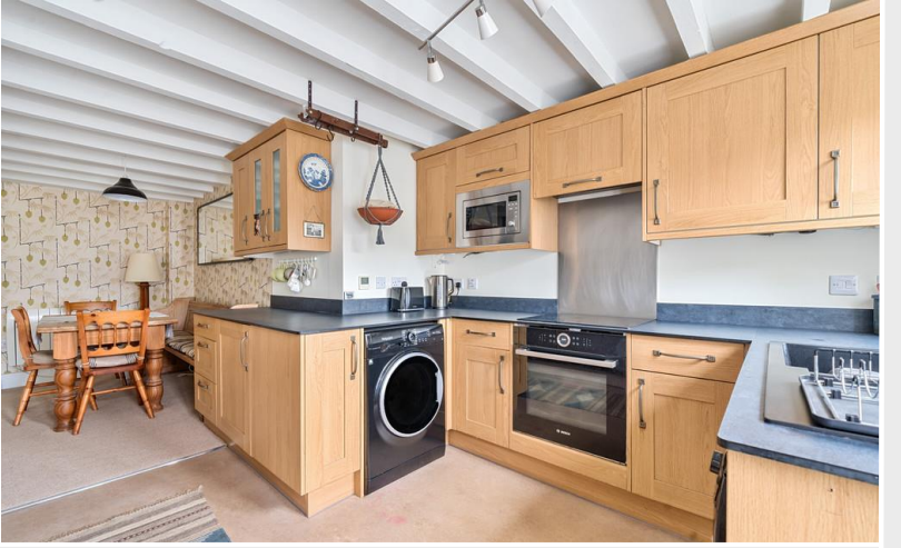
Open Plan Kitchen/Living/Dining Area