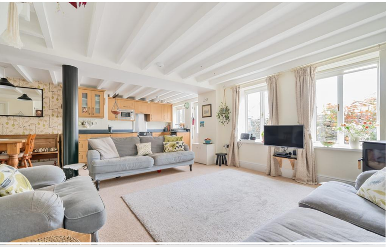
Open Plan Kitchen/Living/Dining Area