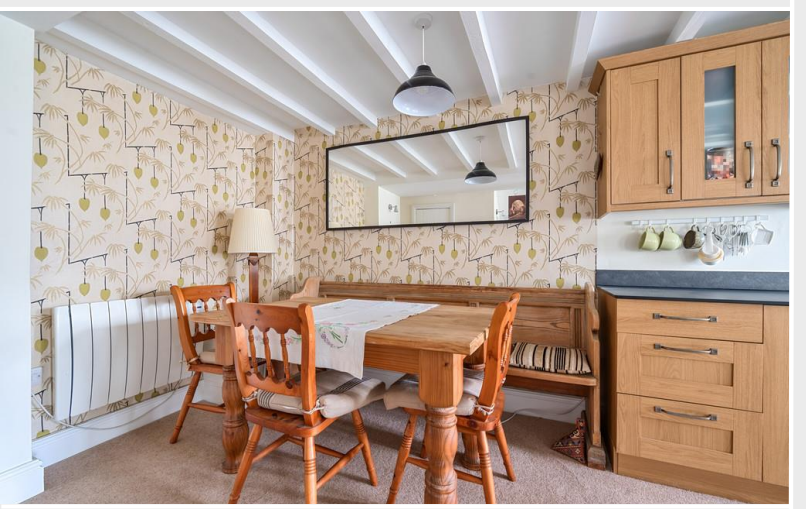
Open Plan Kitchen/Living/Dining Area