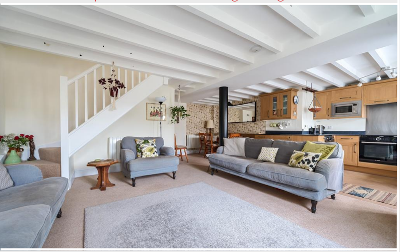
Open Plan Kitchen/Living/Dining Area