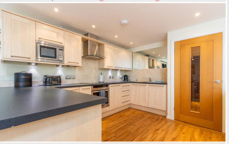
Open Plan Living/Kitchen/Dining Room