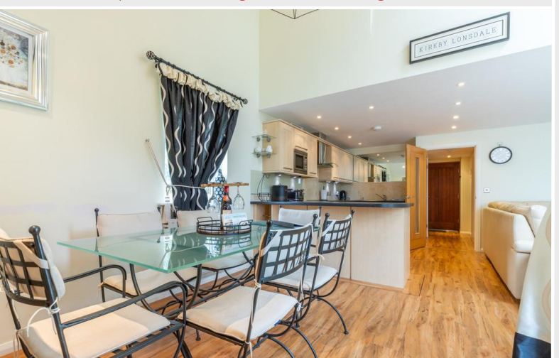
Open Plan Living/Kitchen/Dining Room