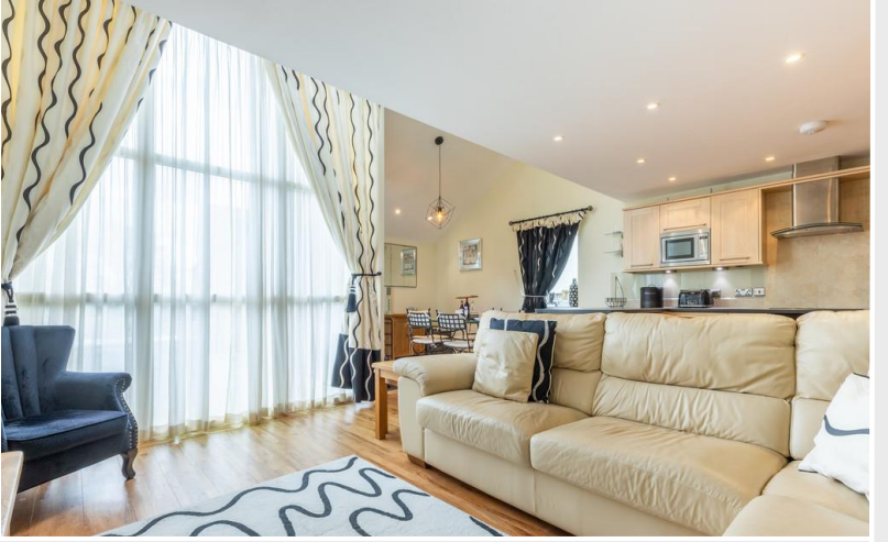
Open Plan Living/Kitchen/Dining Room