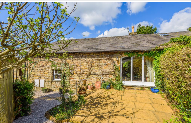
Rear Garden / Patio