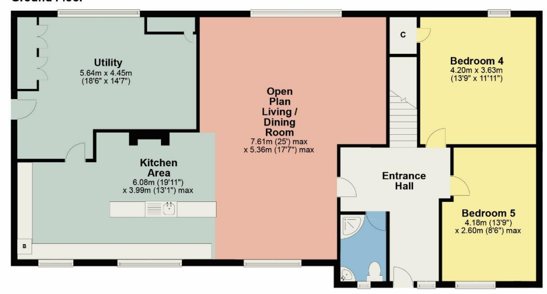
Total area: approx. 253.4 sq. metres (2727.2 sq. feet) For illustrative purposes only. Not to scale.

A thought from the owners...Ingleton is the perfect place for families to live, our home is brilliant for large families affording ample space for guests to visit. We adore the surroundings and the views of Kingsdale are unbeatable.