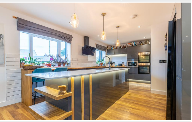
Open Plan Kitchen/Living/Diner