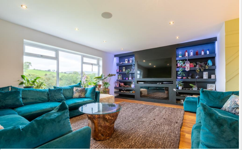
Open Plan Kitchen/Living/Diner