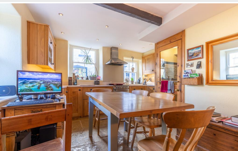
Kitchen Dining Room