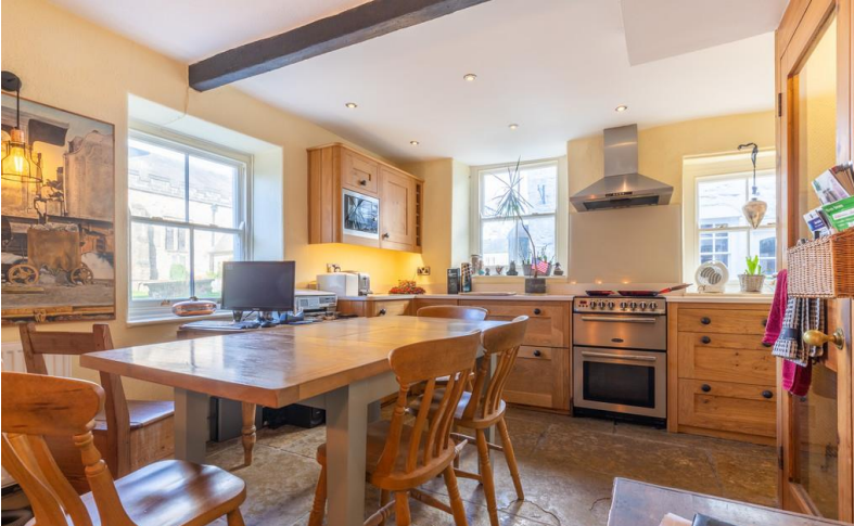
Kitchen Dining Room