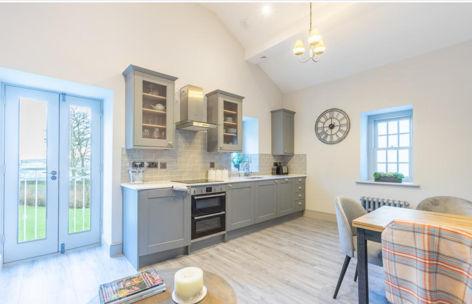
Open Plan Kitchen/Dining/Living Area