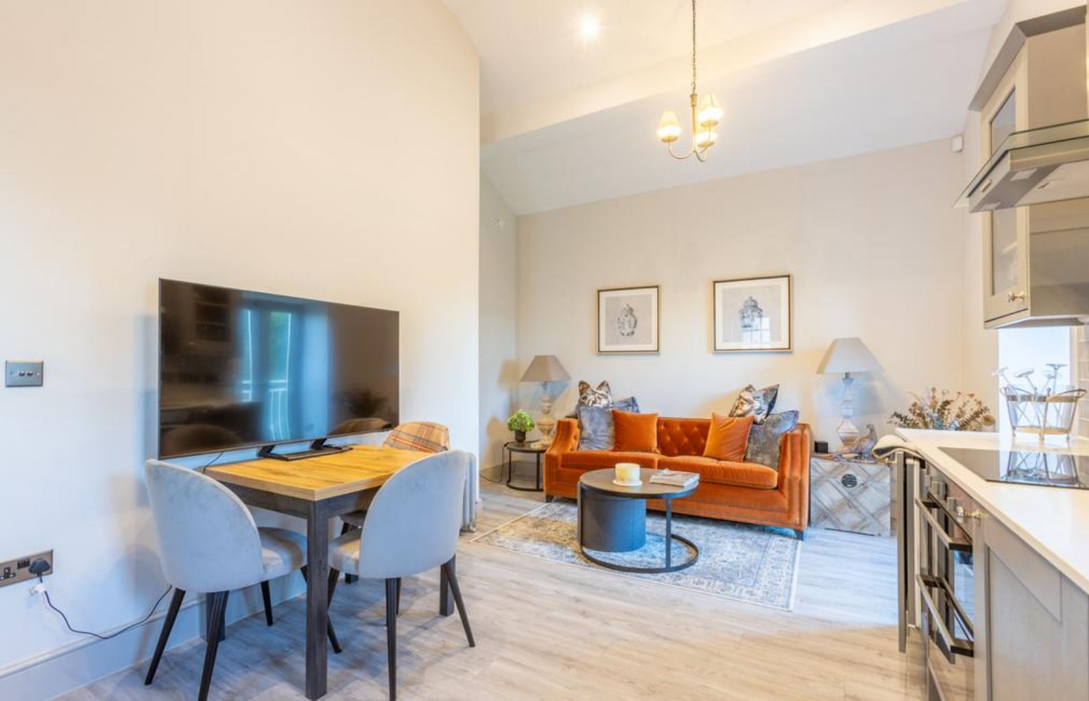
Open Plan Kitchen/Dining/Living Area