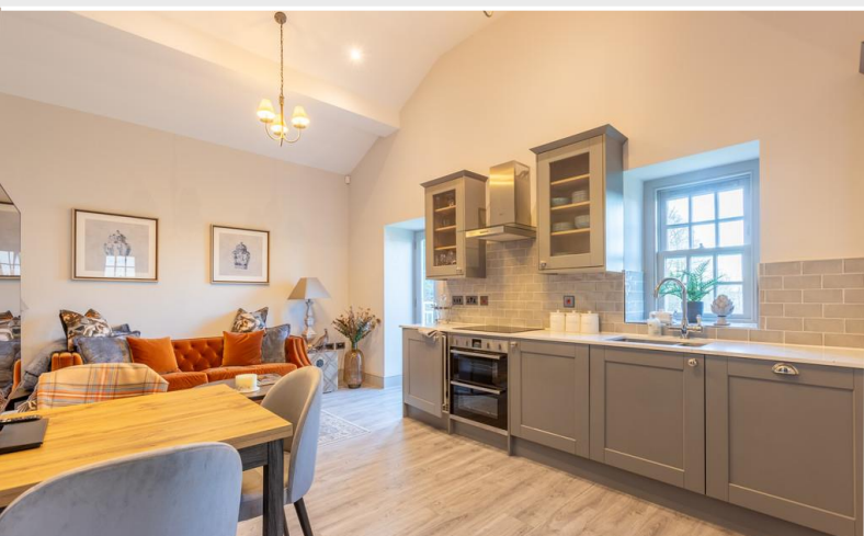
Open Plan Kitchen/Dining/Living Area

The high-end kitchen boasts stylish grey shaker-style base and wall units, beautifully paired with quartz countertops. Integrated Neff appliances include an oven with an induction hob and extractor fan, an undercounter fridge and dishwasher, tastefully completed with tiled splashbacks.