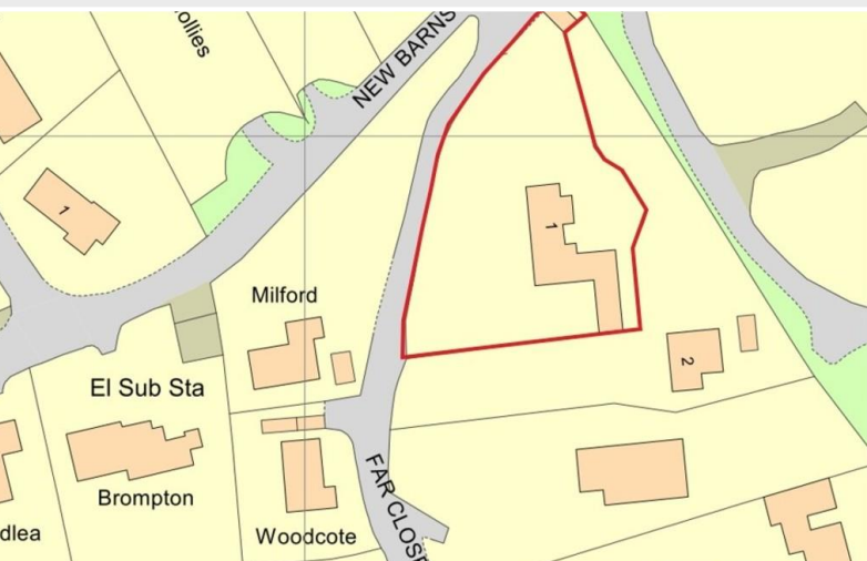
Ordnance Survey 00781527