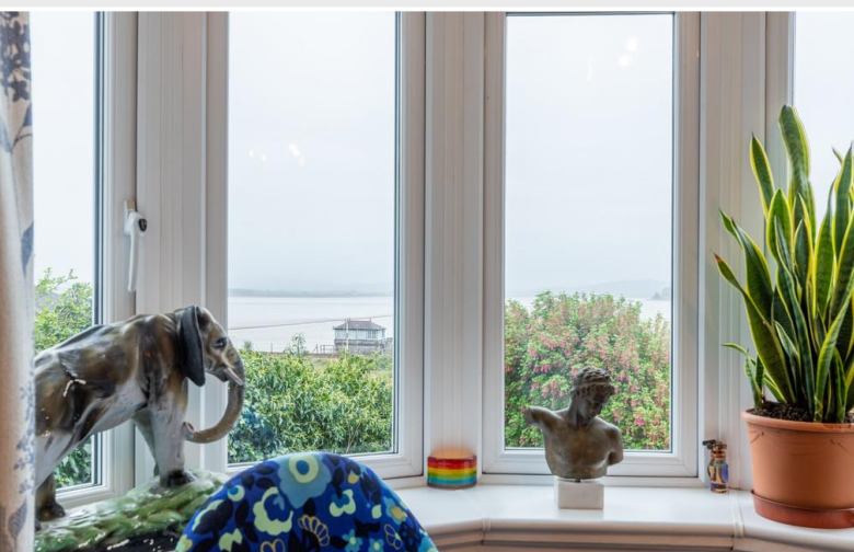
Views from Gowan Brae