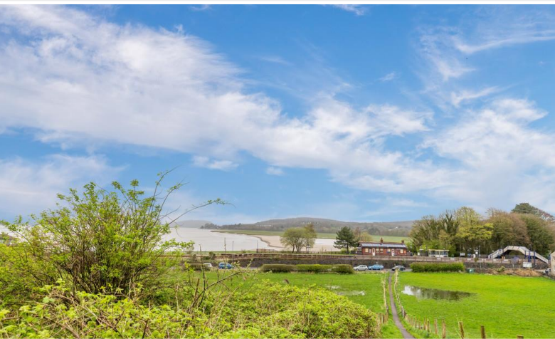
Views from Gowan Brae