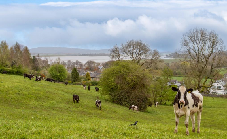
Views from the Front Elevation