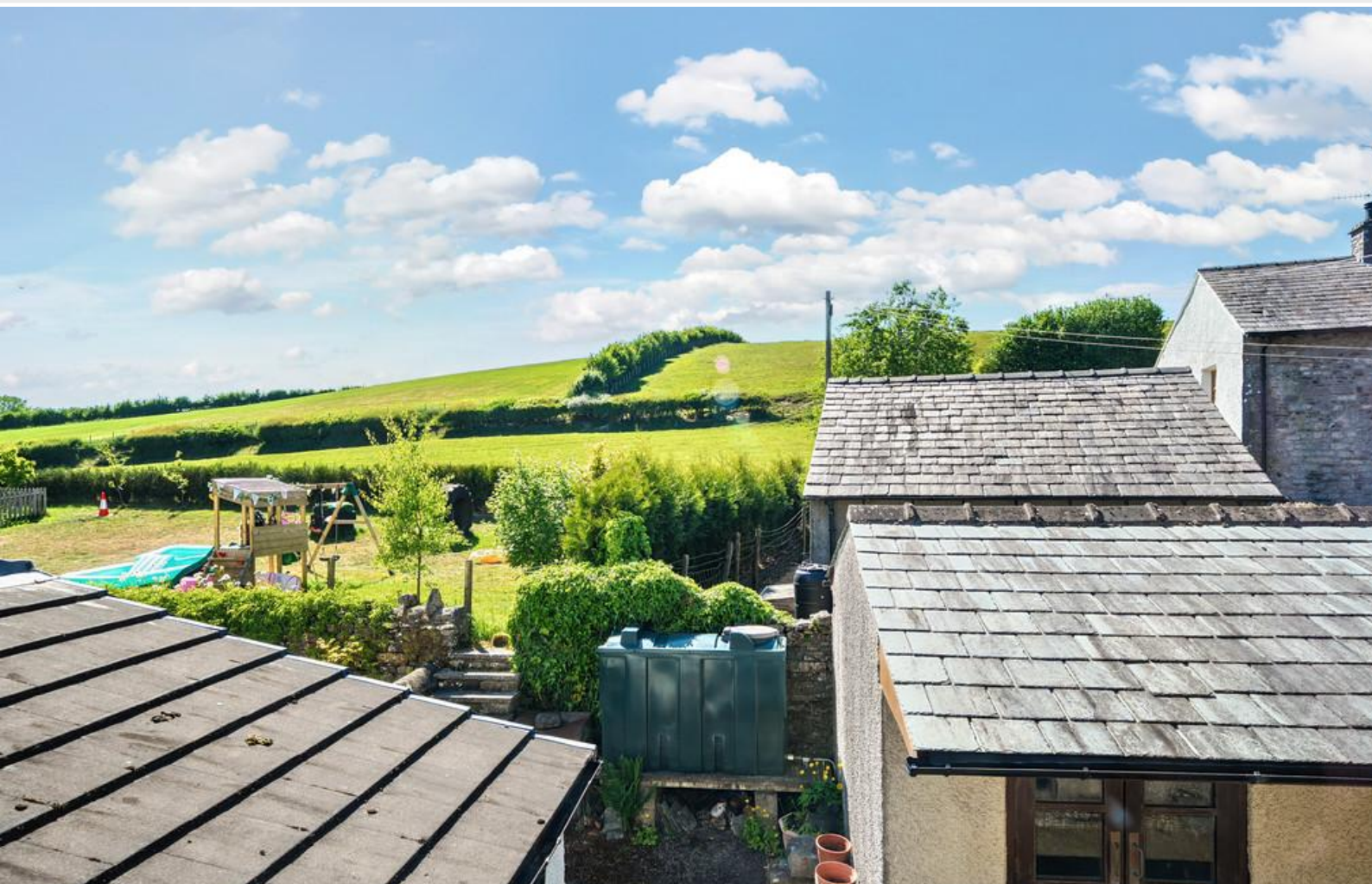
Countryside Views from Bedroom Two