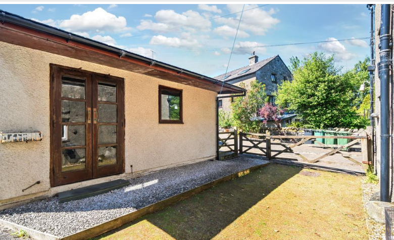
Summerhouse / Workshop