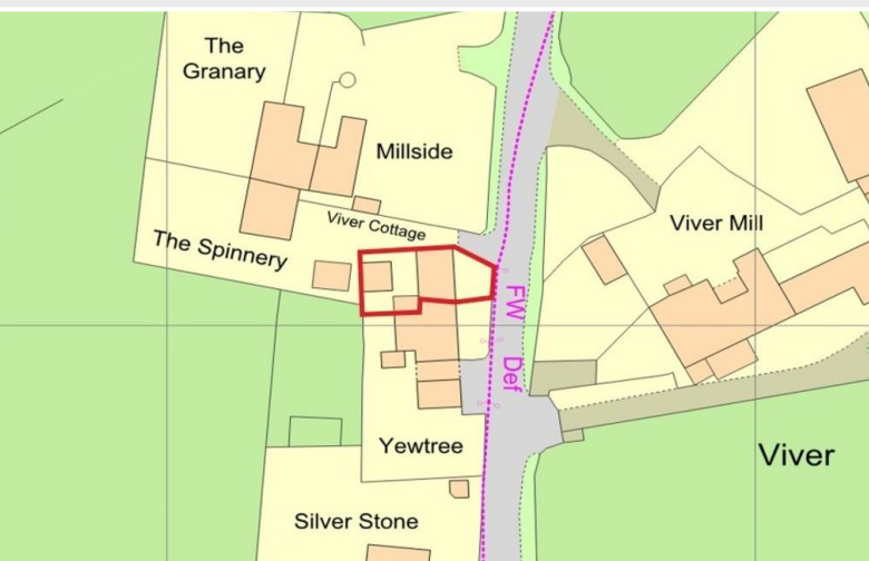
Ordnance Survey 01224018

Energy Performance Certificate The full Energy Performance Certificate is available on our website and also at any of our offices.