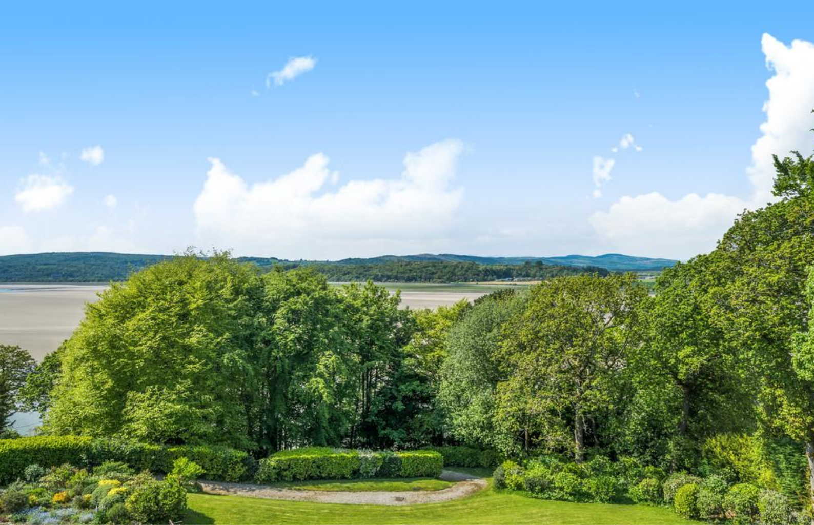
Far Reaching Views