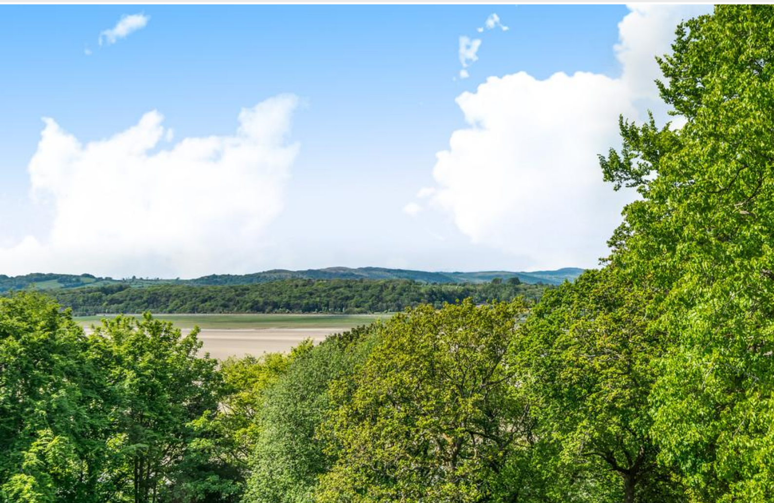
Far Reaching Views