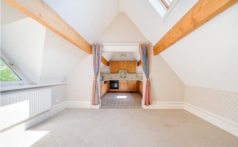
Kitchen Dining Area