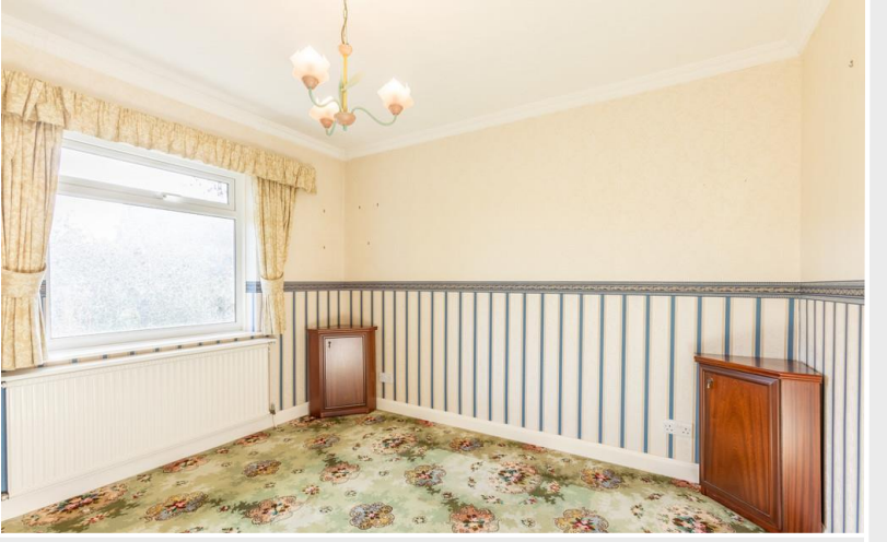
Bedroom Two Dining Room