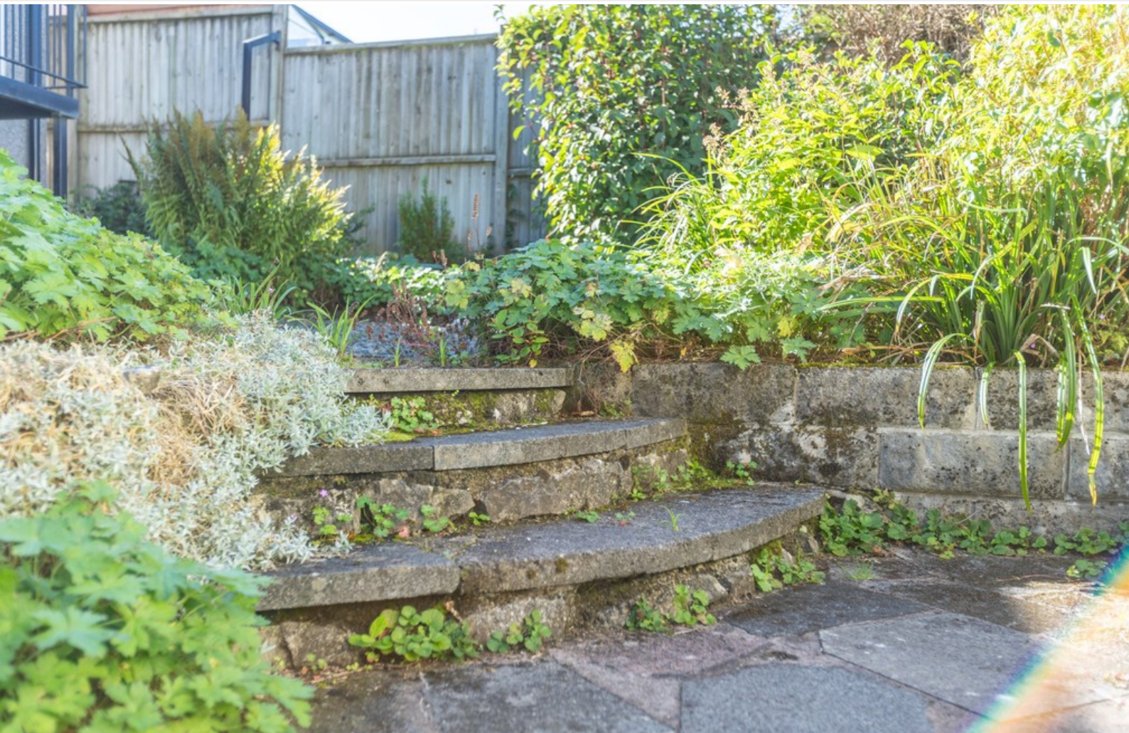
35 Burntbarrow Rear Garden