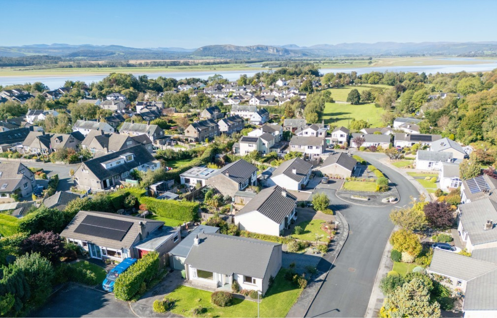
35 Burntbarrow Drone View