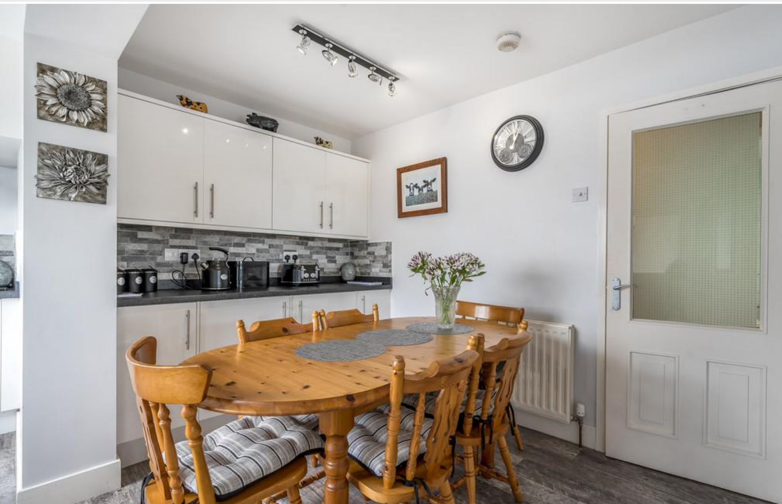
Kitchen Dining Room