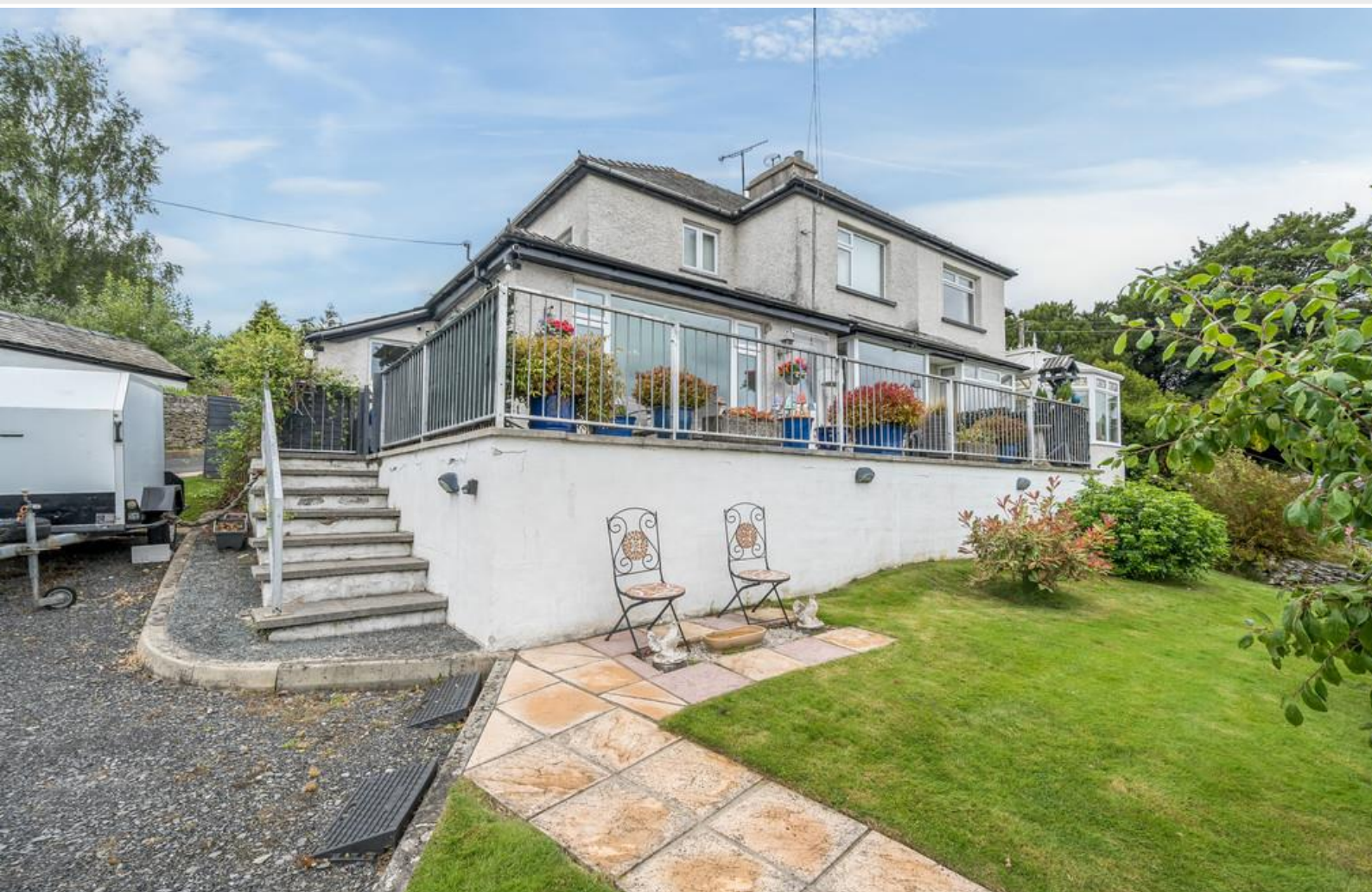
1 Fields View