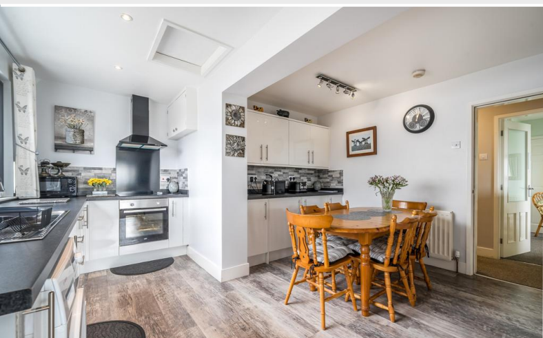
Kitchen Dining Room