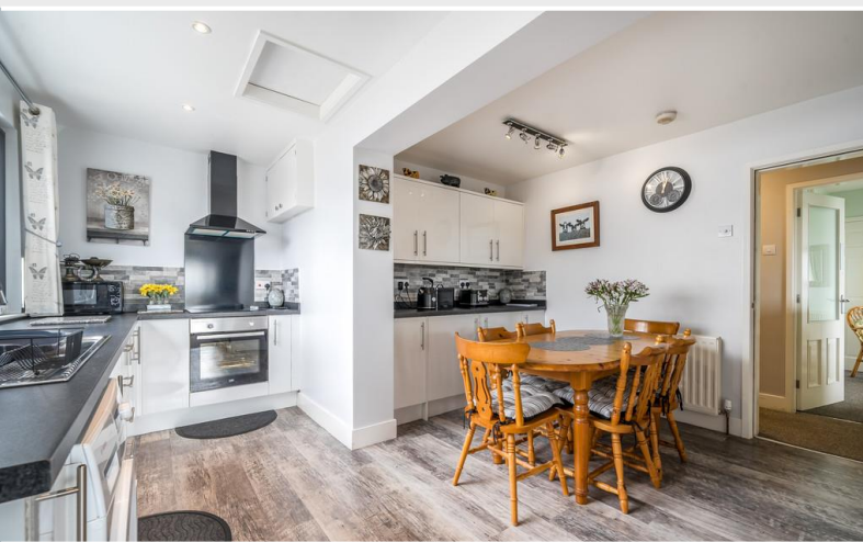
Kitchen Dining Room