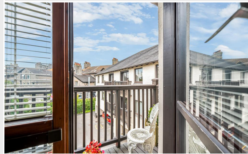
30 Ashleigh Court Balcony