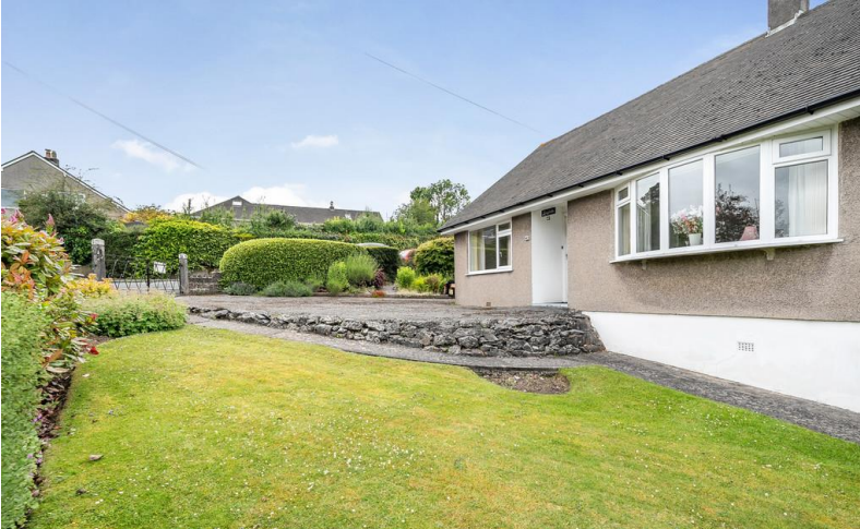
40 Swinnate Road