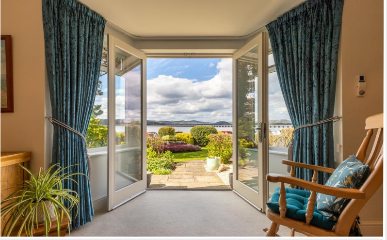
Living Room Views