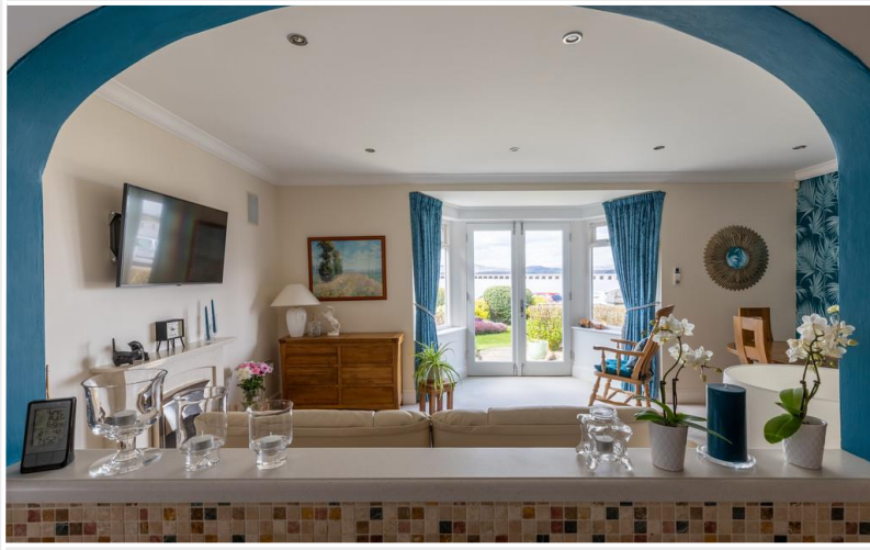
Kitchen Breakfast Bar