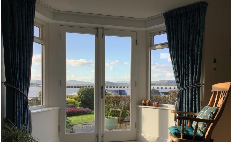
Living Room Views