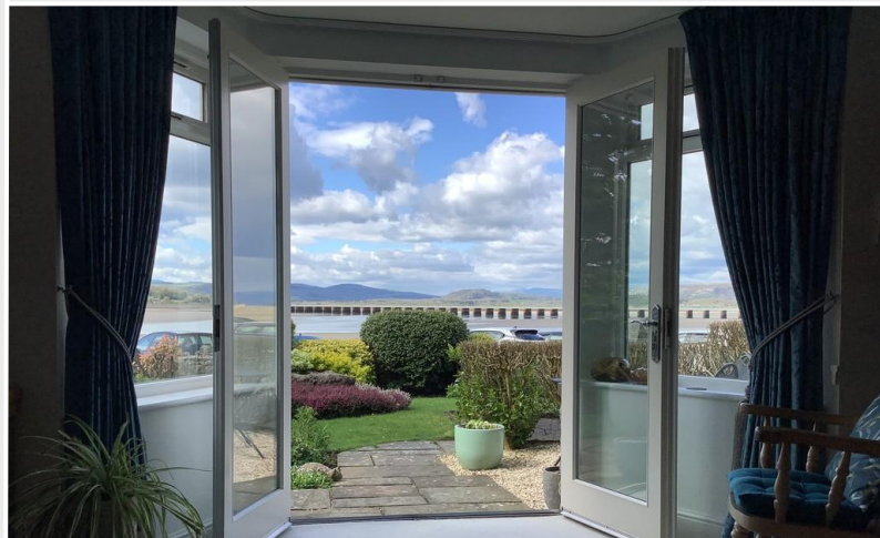
Living Room Views