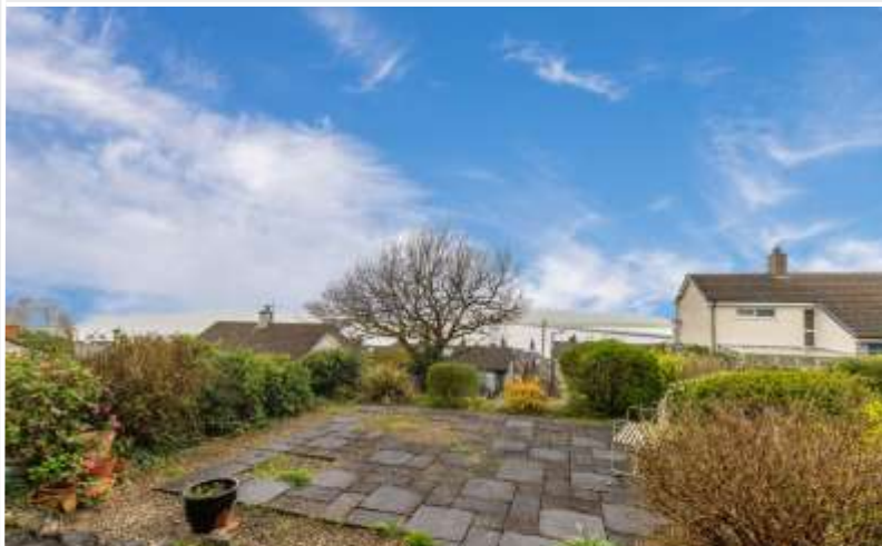
View from the front of the property