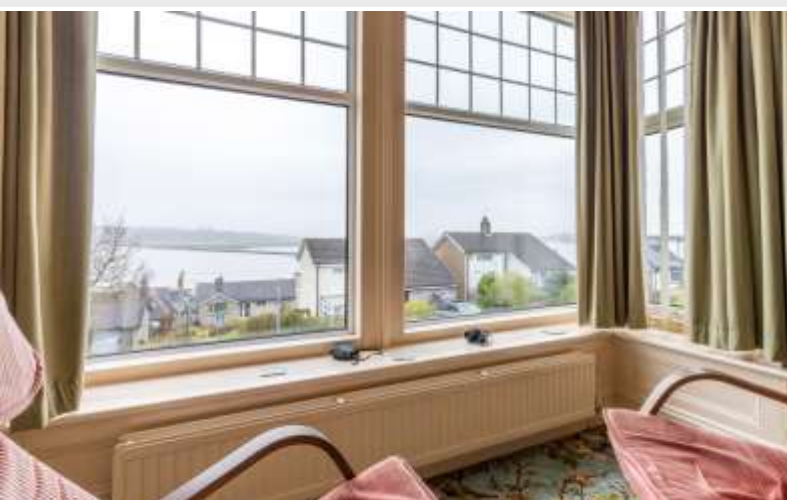
Views From Living Room Over The Kent Estuary