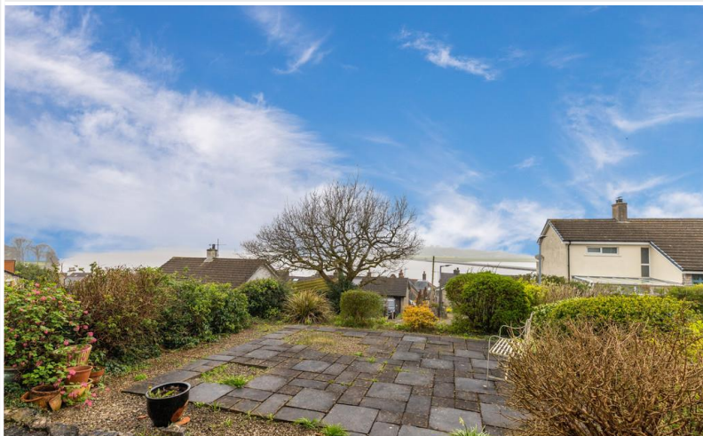
View from the front of the property