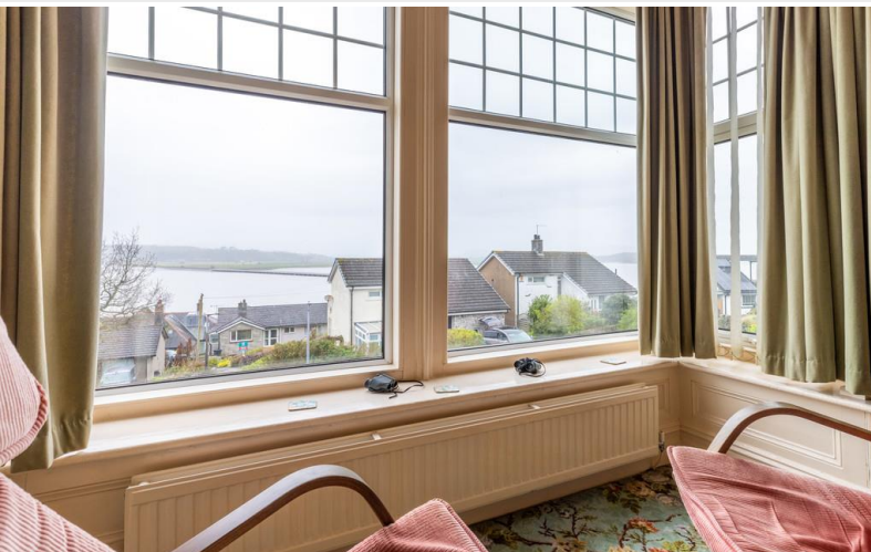
Views From Living Room Over The Kent Estuary