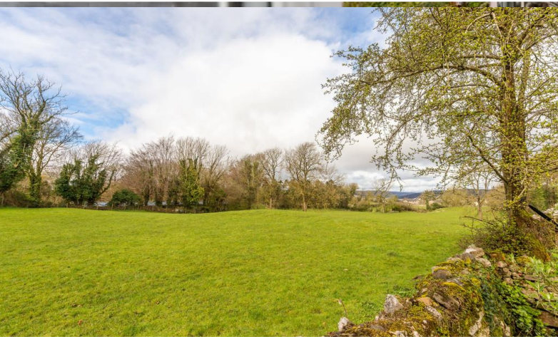
Field View from Rear Garden