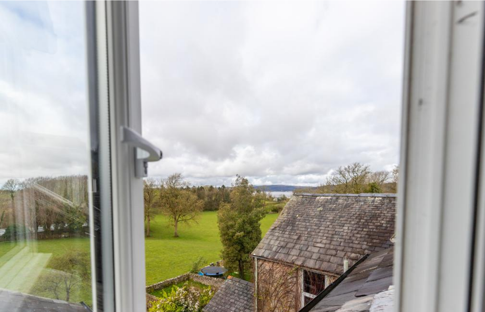
Views from the Loft Room