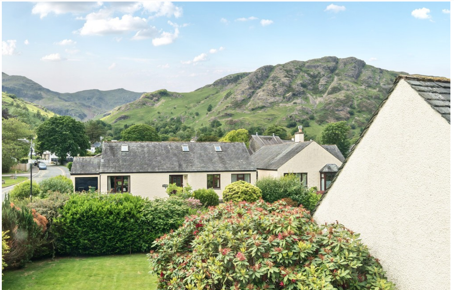
Garden and Fell Views from Property