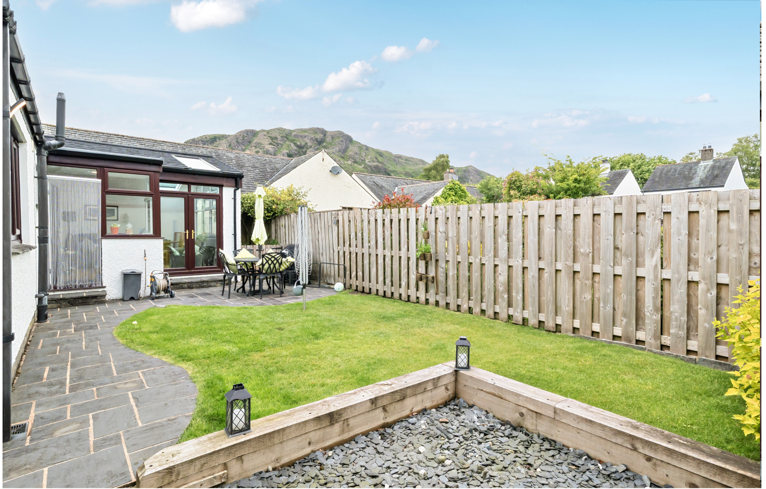
Garden and Patio Seating Area