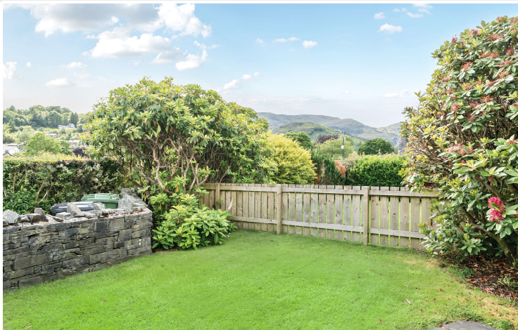
Front Garden and Views

Broadband Superfast Broadband available through Openreach network.