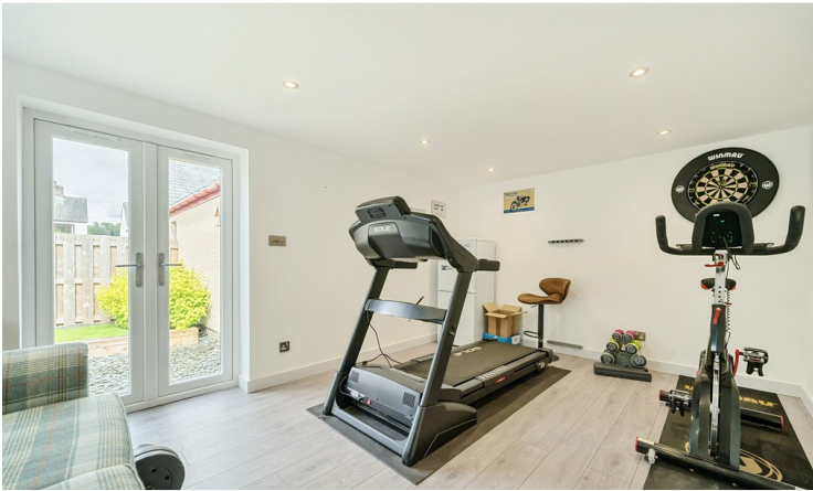
Home Gym in Former Double Garage