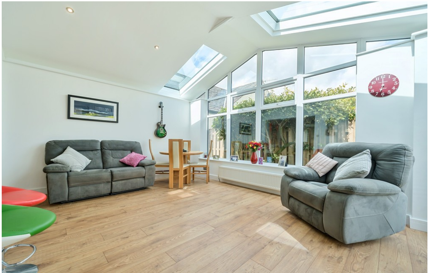
Conservatory Style Dining Area