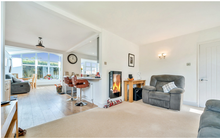
Open Plan Living Space