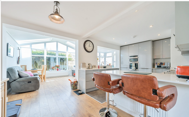
Open Plan Living Space