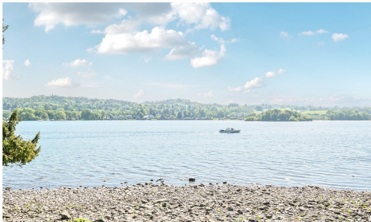
Shared Lake Frontage