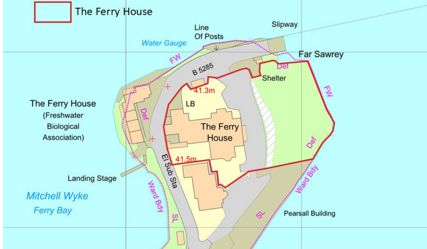
Ordnance Survey Map Ref -095400