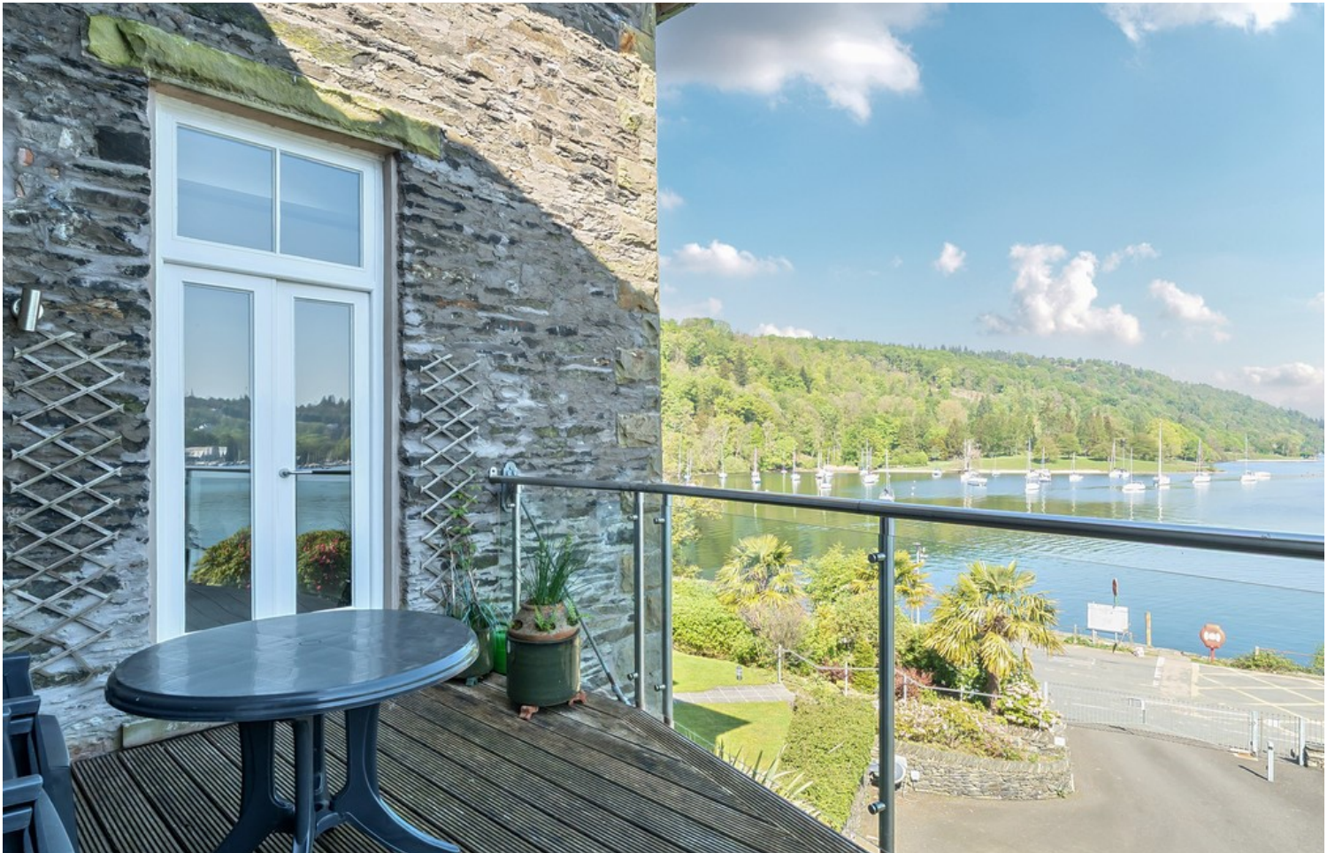
View from Balcony