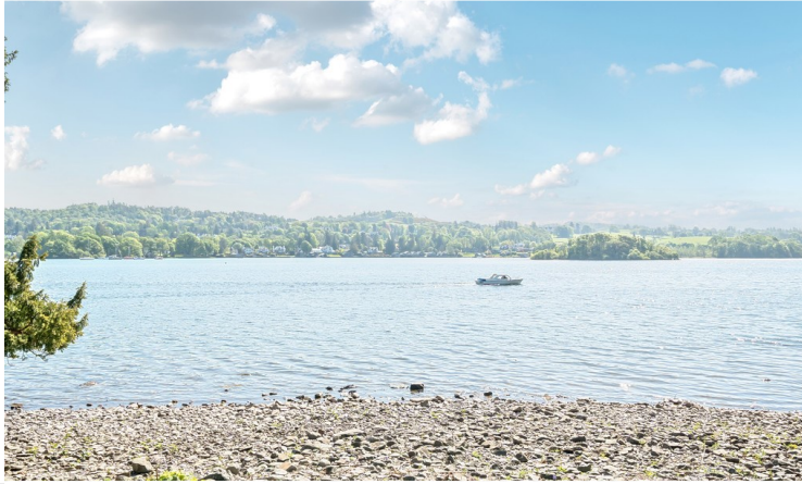
Shared Lake Frontage