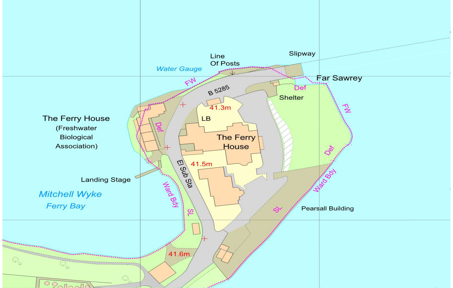
Ordnance Survey Map Ref -095400