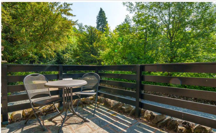
Private Patio Terrace