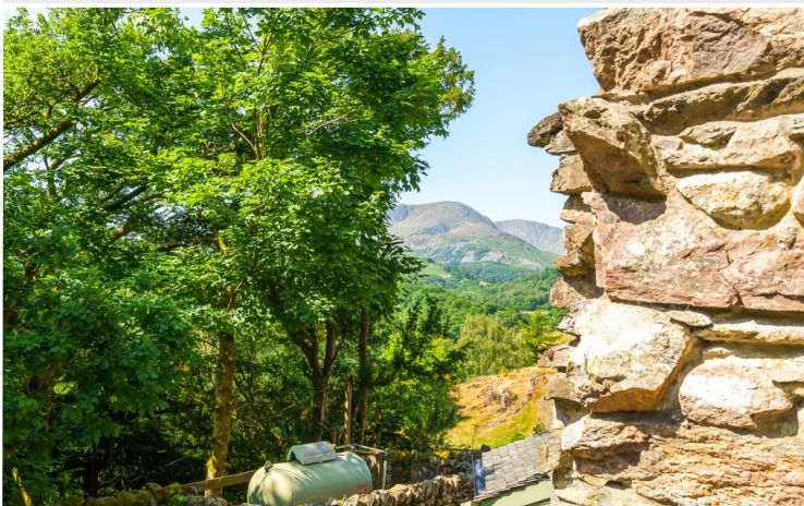
View from Terrace