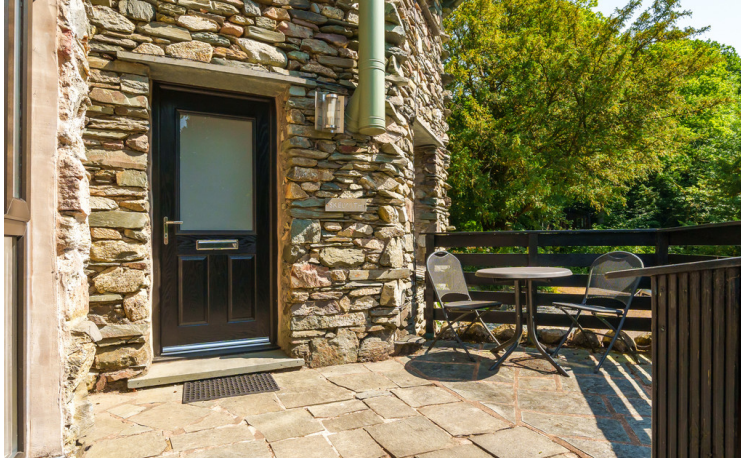
Private Patio Terrace