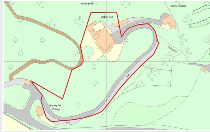
Ordnance Survey Map - Brathay Fell