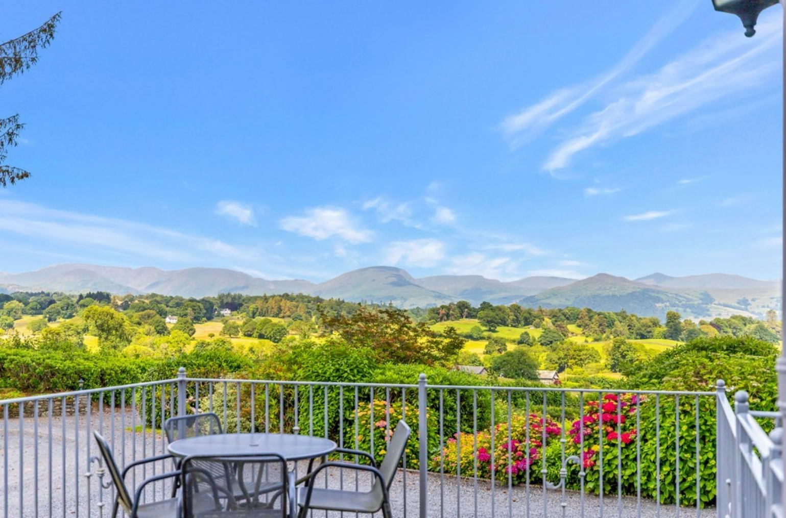
Private Patio Seating Area