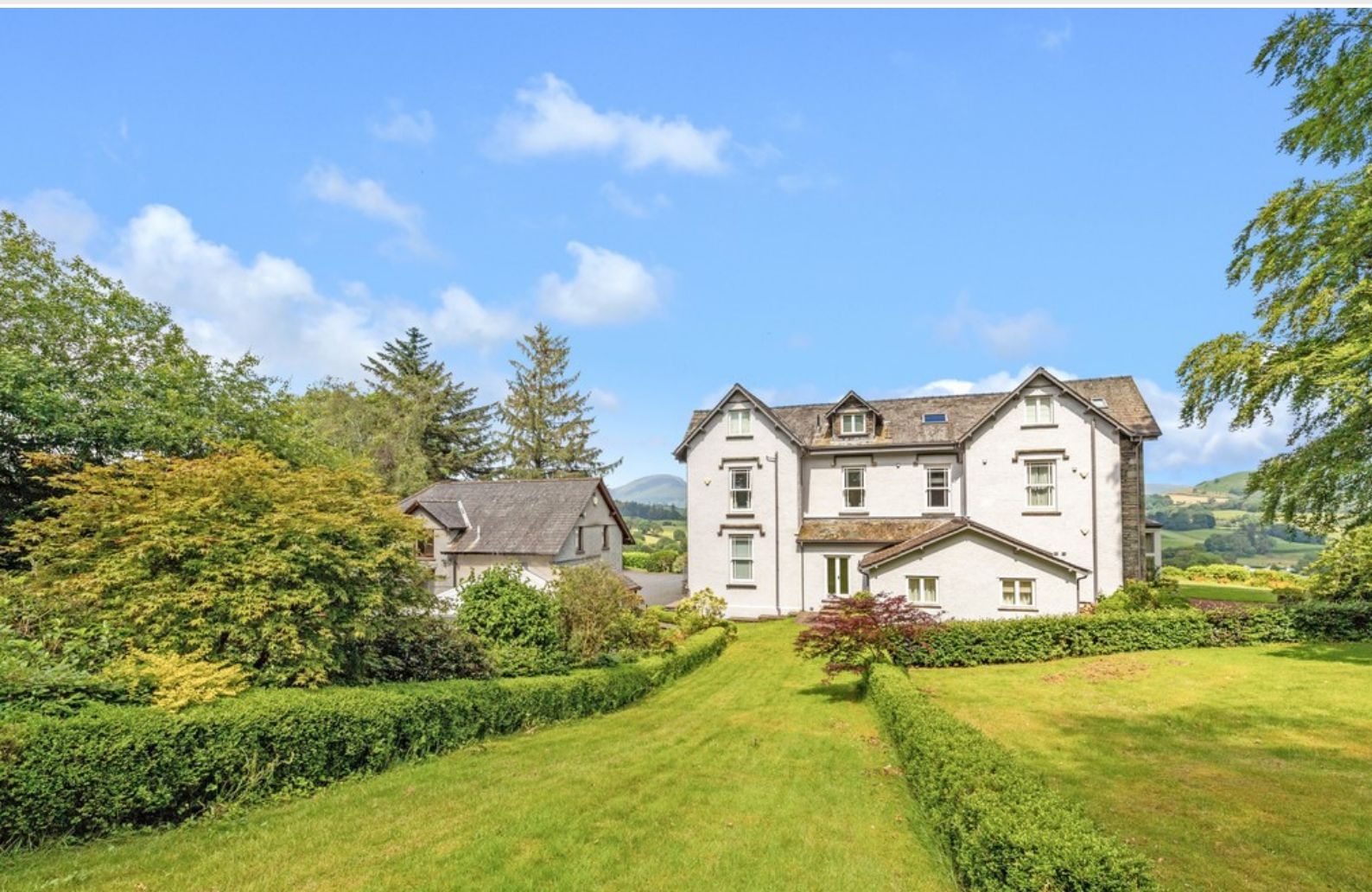
Rear Elevation and Private Garden