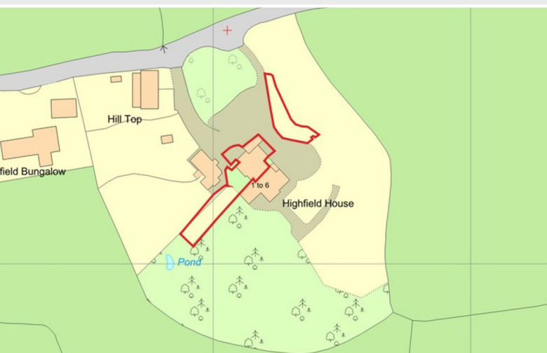
Ordnance Survey Ref 01174872

service charge for 2024/25 is £3,600 per annum, Building Insurance is £824 per annum, and a contribution to the sinking fund is £1,200 per annum.