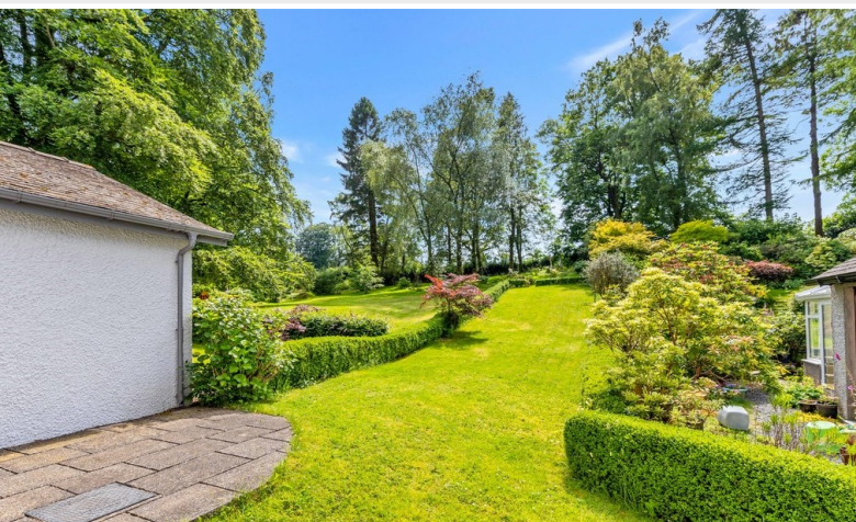
Private Rear Garden