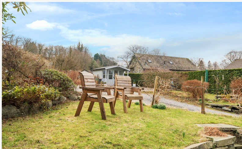
Front Garden Grassed Seating Area