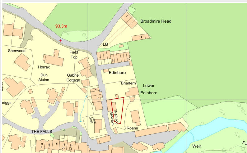
Ordnance Map Ref 01207831