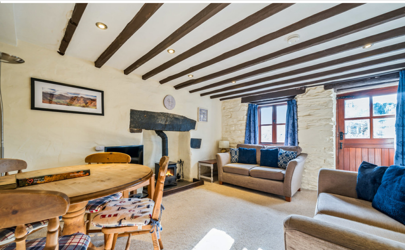
Dining Area in Sitting Room