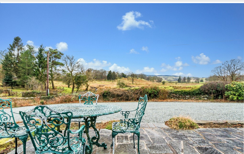
Patio Seating Area

Entering in to the main entrance hall which is a useful and open space ideal for muddy boots and wet outdoor clothes before leading you in to a bright and airy breakfast kitchen. Here, you will be stopped in your tracks by the incredible view from the bay window, which allows plenty of natural light in. Providing everything one would need for modern day living with a range of stylish wall and base units, laminate worktops, stainless steel sink and drainer, gas hob with extractor over, eye level oven, integrated dishwasher, fridge freezer and washer dryer – this well equipped kitchen is the perfect space to enjoy a meal with family and friends.